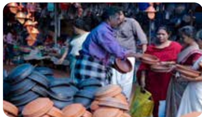
16 Samkranthi Vaanibham