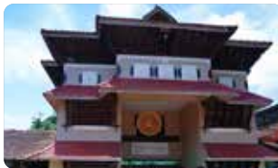
22 Panachikkadu Festival