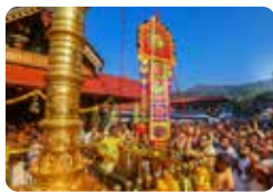
02 Sabarimala Festival