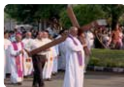
18 Good Friday