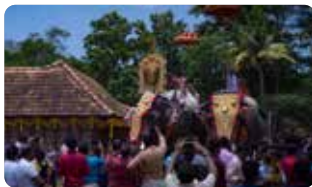
05 Thrikkakkara Vamana Moorthy Temple Festival