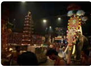
01 Guruvayur Ekadashi