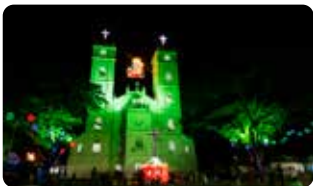
24 Feast of Vallarpadathamma