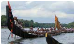
09 Aranmula Boat Race