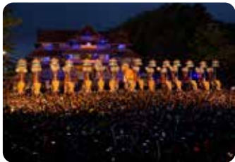
06 Thrissur Pooram