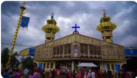
12 Koratty Muthy Feast