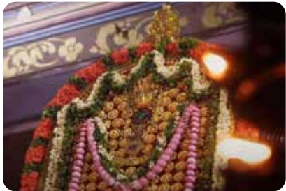
26 Thrippunithura Arattu