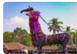
04 Aryankavu Pooram