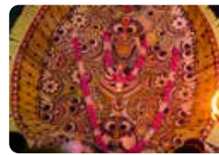
14 Kadammanitta Padayani