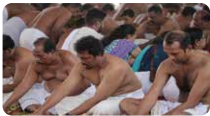
24 Karkkidaka Vavu