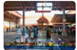
Chottanikkara Makam Thozhal