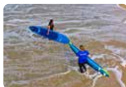
International Surfing Festival