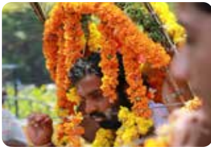
Harippad Thaipooyam Mahotsavam