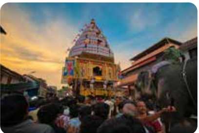
14 Kalpathy Ratholsavam