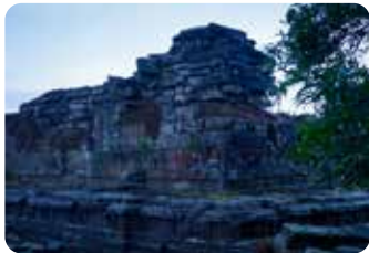
12 Chitra Pournami Festival