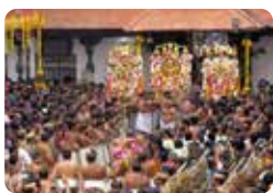
11 Sree Padmanabhaswami Temple Arattu