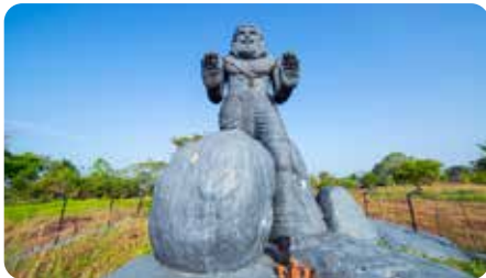
18 Rayiranellur Malakayattam