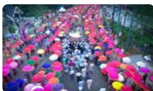
08 Manarcad Perunnal