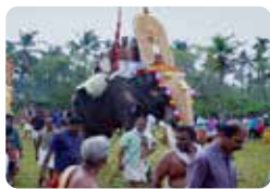
08 Pidikkaparambu Aanayottam