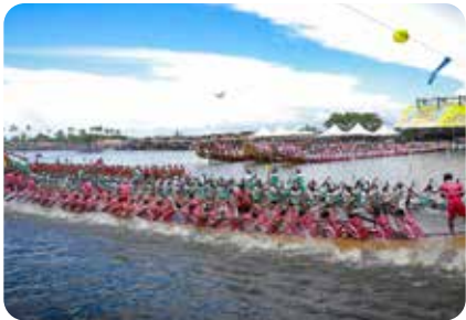
09 Nehru Trophy Boat Race