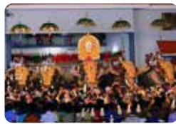
08 Tharakkal Pooram