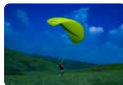
International Paragliding Festival