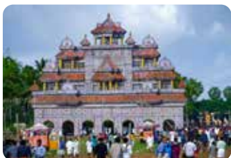
24 Kannambra Vela