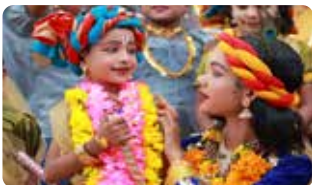
14 Sree Krishna Jayanthi