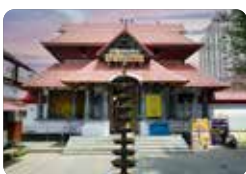
20 Thali Maha Temple Arattu Festival