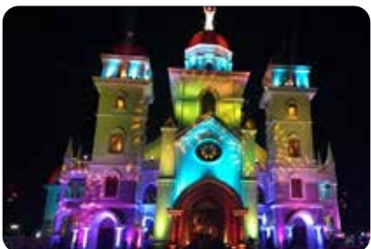
23 Vettukadu Feast