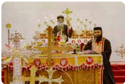
02 Parumala Perunnal