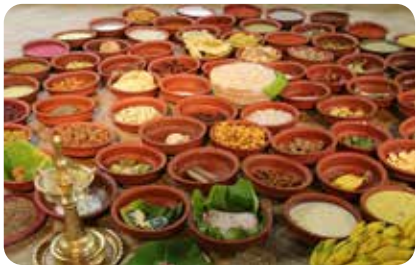
13 Aranmula Vallasadya