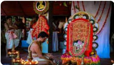
16 Vettikode Ayilyam