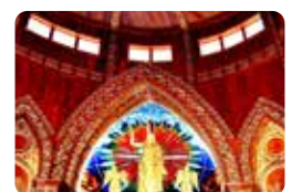
27 Malayattoor Perunnal