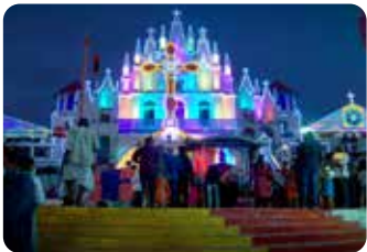
07 Puthuppally Perunnal