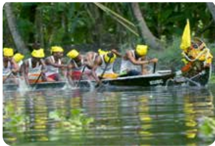
14 Kumarakom Boat Race