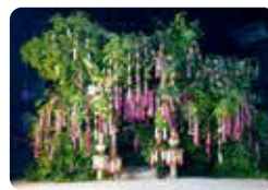
10 Sree Padmanabhaswami Pallivetta