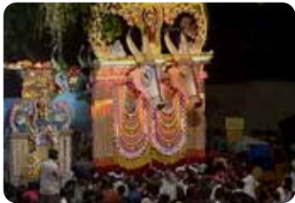
12 Thootha Pooram