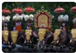
03 Nenmara Vallangi Vela