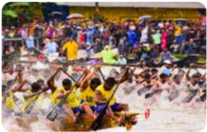
09 Champakkulam Moolam Boat Race