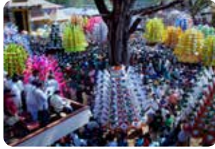
Koorkancherry Thaipooyam Mahotsavam