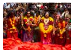
Kodungalloor Kavutheendal & Bharani