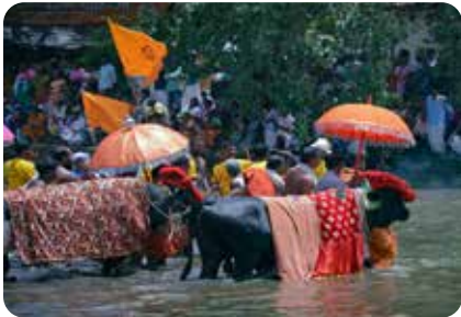
15 Oachira Festival