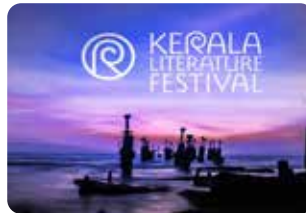
Kerala Literature Festival