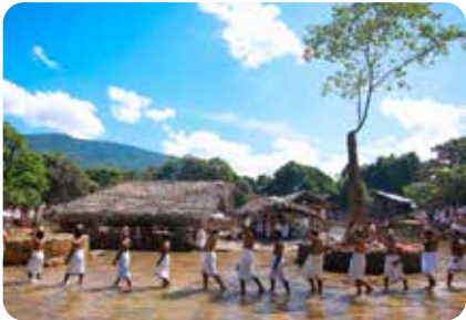
10 Kottiyoor Festival