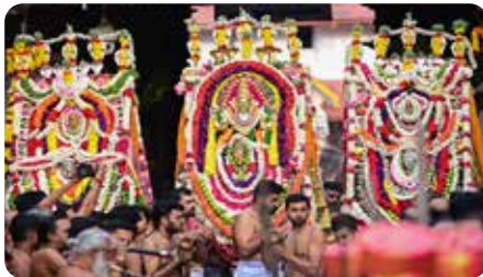
30 Alpashi Festival