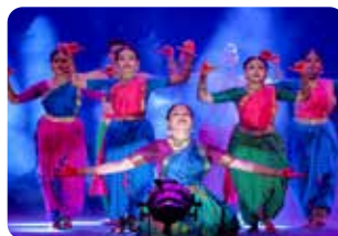
Nishagandhi Dance Festival