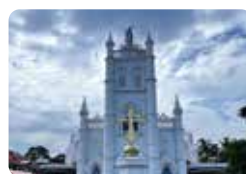
24 Aruvithura Perunnal