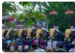
10 Kavassery Pooram