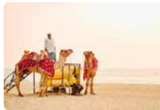
Bekal International Beach Festival