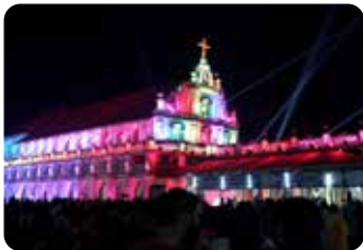
07 Edathua Perunnal