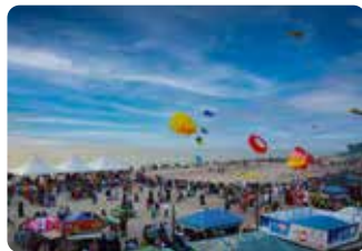
Beyport International Water Festival