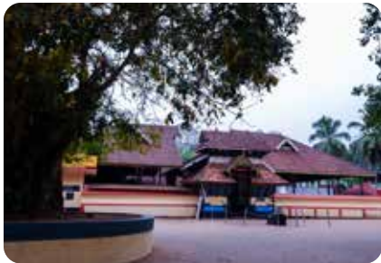
01 Nelluvai Oushadha Seva Dinam