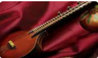
22 Navaratri Music Festival