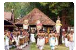
10 Lokanarkavu Temple Festival