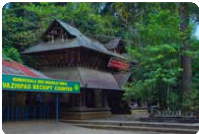
12 Mannarassala Ayilyam