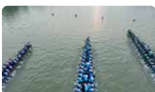
29 Kallada Boat Race