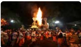
21 Neelamperoor Padayani