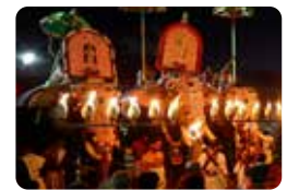
06 Peruvanam Pooram