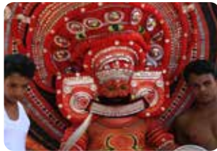
Andalur Kavu Theyyam