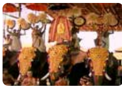
03 Thirumandhamkunnu Pooram