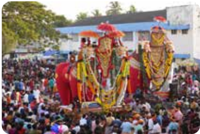
17 Oachira Kalakettu