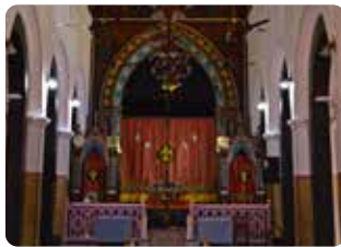
21 Niranam Valiyapally Perunnal