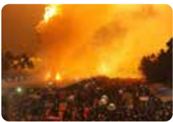
09 Arattupuzha Pooram