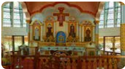
28 Feast of Saint Alphonsa Church