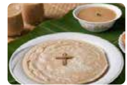
17 Maundy Thursday