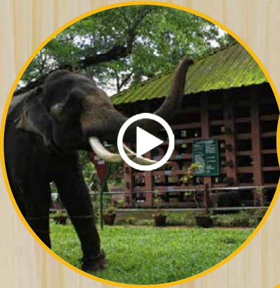
Konni Elephant Camp