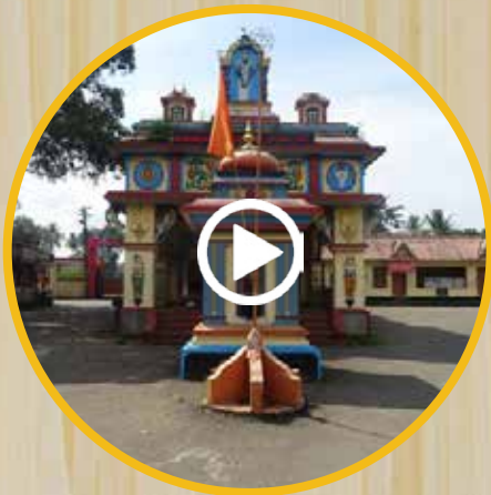
Sree Vallabha Temple