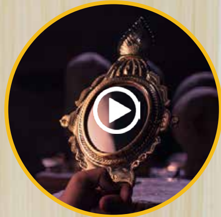
Heritage Village, Aranmula