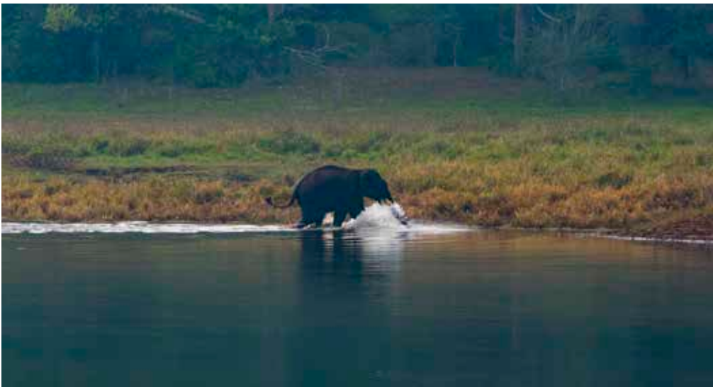
Elephant ( Elephantidae )