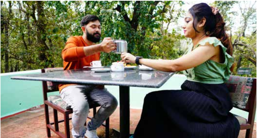
Tourists can dine at the multi-cuisine restaurant or at the balcony enjoying the environs