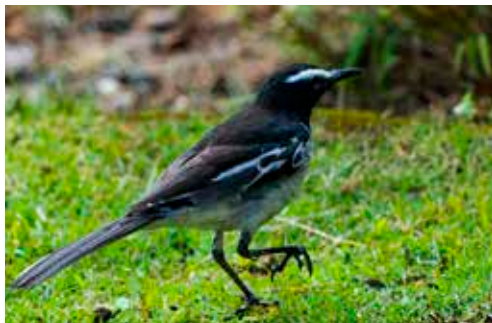
Cinereous Tit ( Parus Cinereus )