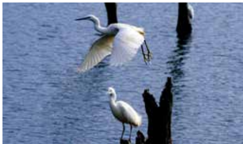
Little Egret ( Egretta Garzetta )