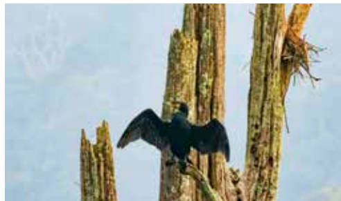
Little Cormorant ( Microcarbo Niger )