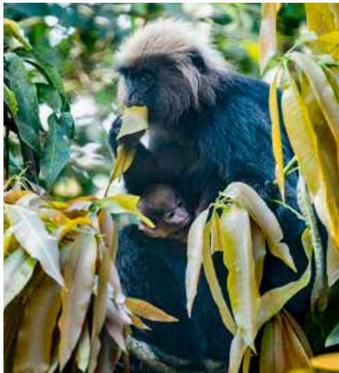
Nilgiri Langur ( Trachypithecus Johnii )