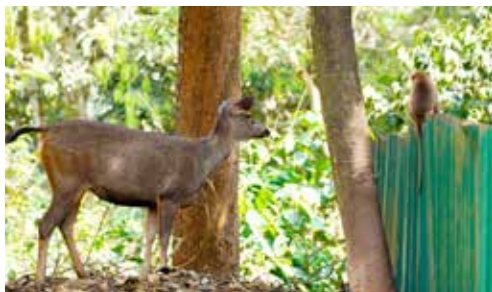
Sambhar Deer ( Rusa Unicolor )