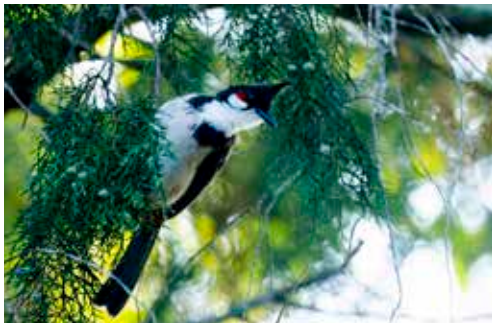
Red-whiskered Bulbul ( Pycnonotus Jocosus )