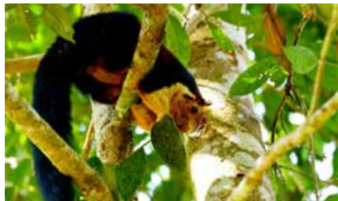
Malabar Giant Squirrel ( Ratufa Indica )