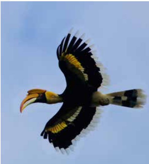
Great Indian Hornbill ( Buceros Bicornis )