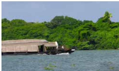
Pathiramanal Island, about 17 km