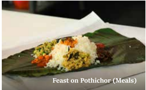
Feast on Pothichor (Meals)