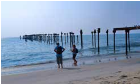
Alappuzha Beach, about 3 km