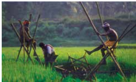
Kuttanad, about 20 km