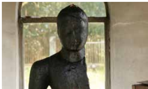
Karumadi Kuttan, about 20 km