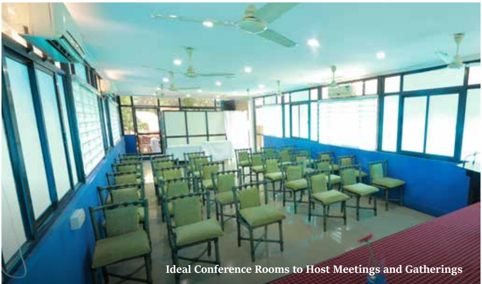
Ideal Conference Rooms to Host Meetings and Gatherings