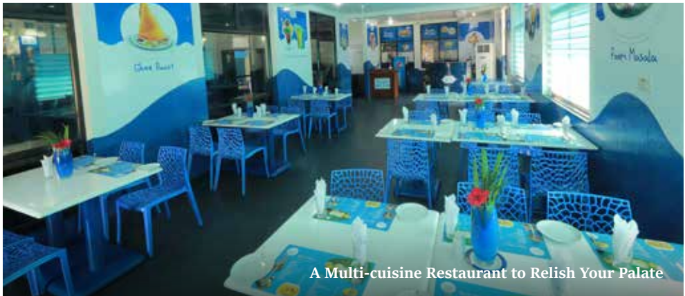
A Multi-cuisine Restaurant to Relish Your Palate