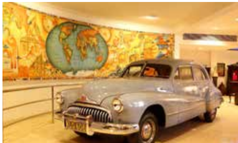
Revi Karunakaran Memorial Museum, about 1 km