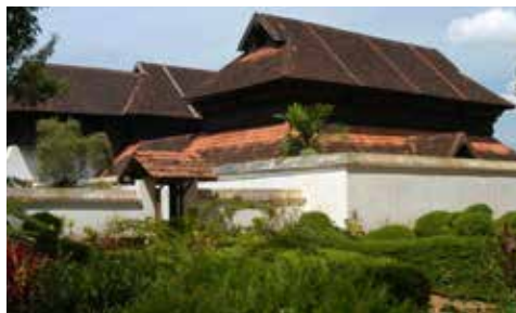
Krishnapuram Palace, about 50 km