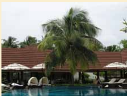
Cottages, The Lalit Resort, Bekal