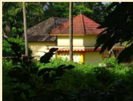
Outside view of Kalingoth Kalari Tharavadu