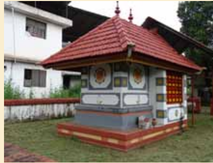
Temple dedicated to Sree Kurumba