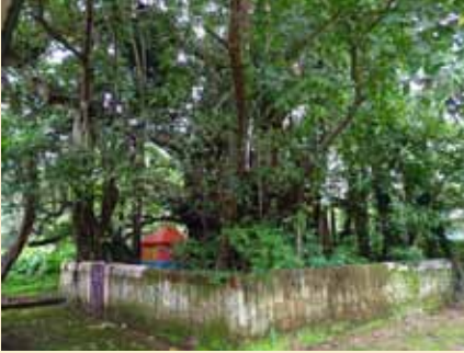
Serpent Grove, Sree Kurumba Bhagavathy Temple