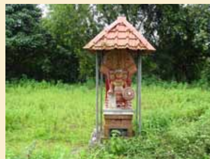
Vairajathan Theyyam Model