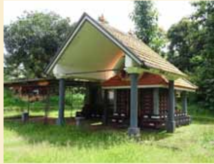
Neelankavil Bhagavathy Temple