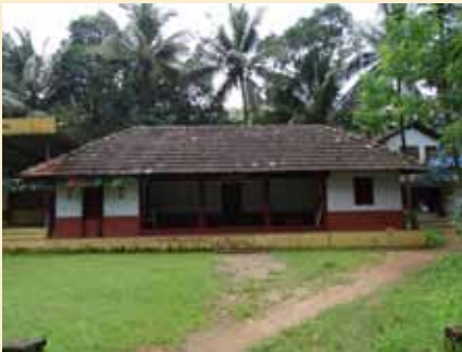
Koothumadam, Sri Kaitheri Edam Bhagavathy Temple