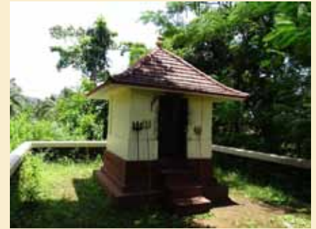
Shrine of Ettikulam Valiya Bhagavathy