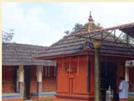
Shrine of Lord Muthappan at Kunnathurpadi