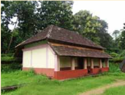
An old palace