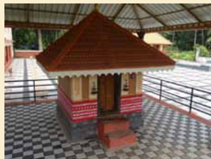
Thayathuveedu Tharavaadu Temple