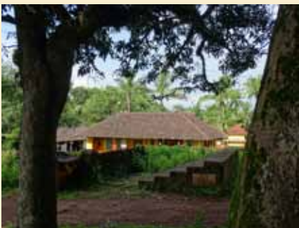
View of Panayal Perunthatta Chamundeshwari Devasthanam