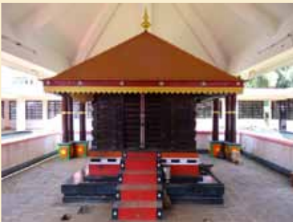
Vellur Sree Kottanachery Temple