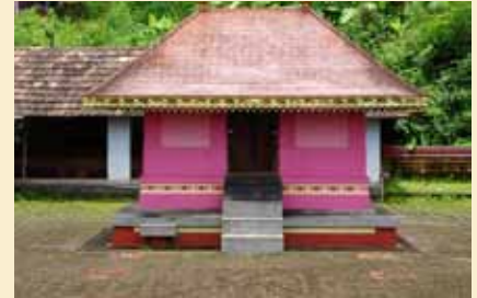
Konath Chathamath Bhagavathy Vettaikorumakan Temple