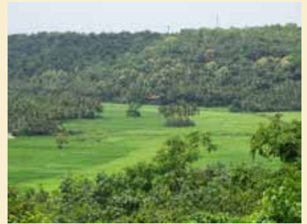
Kasaragod Paddy Fields