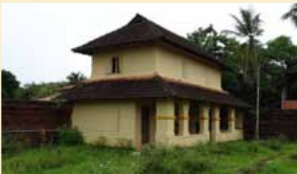
Veerabhadra Temple, Cheruvathur