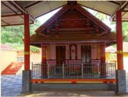
Verikkulam Sree Chooliyar Bhagavathy Temple