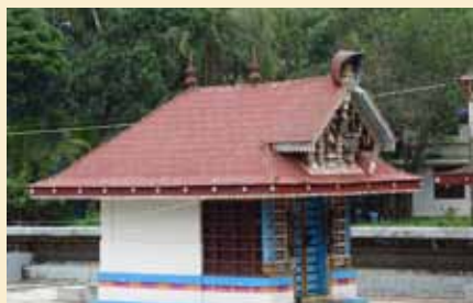
Sub-deity shrine, Lord Rama Temple