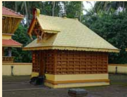
Main Temple of Sree Arayil Bhagavathy Devalayam,