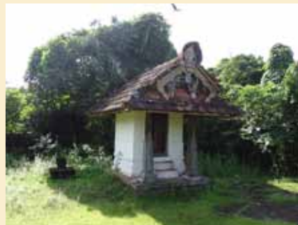
Serpent Shine, Kodoth