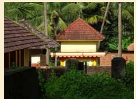
Kalingoth Kalari Tharavadu