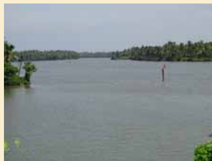
Perumba River, Payyanur