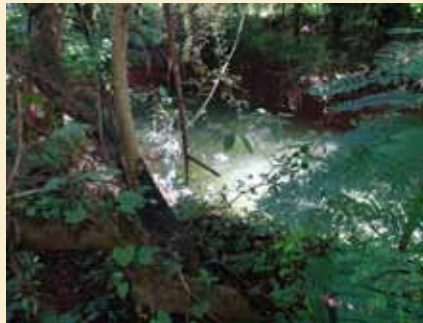
Pond at the heritage house