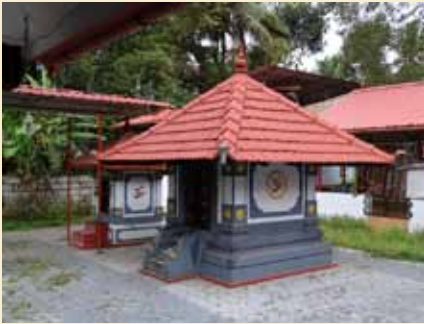
Kurumba Bhagavathy Temple