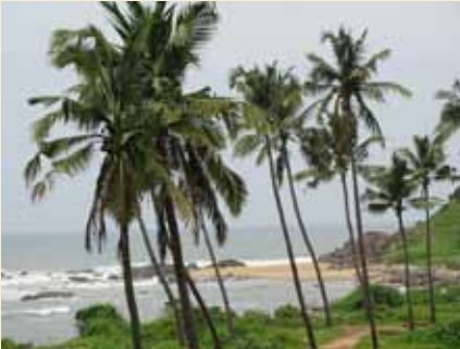
Arabian Sea view, Kottikulam