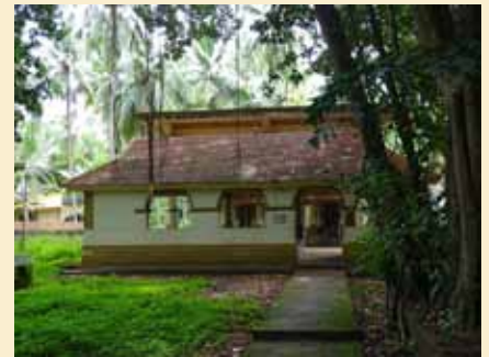
Sree Chooliyar Bhagavathy Temple