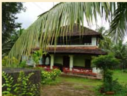
A heritage home, Nileschwaram