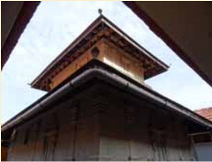
Sanctum Sanatorium of Sree Gopalakrishna Temple