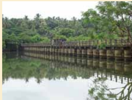
An old bridge near temple