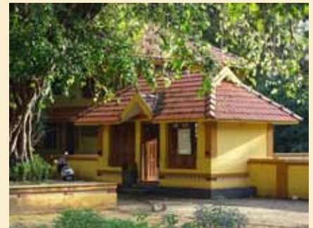
Entrance gateway, Sree Arayil Bhagavathy Devalayam