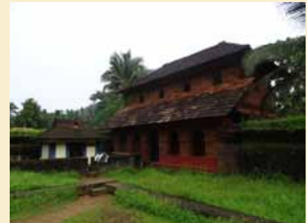
Palace near the temple