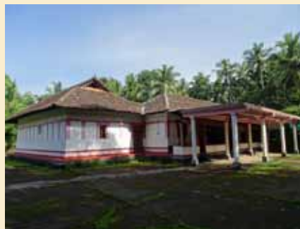
Tharavaadu Temple of Kodoth