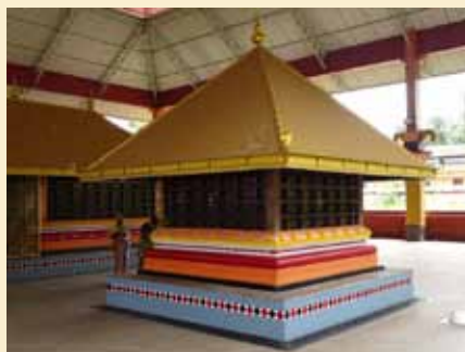
Sub-deity, Palakkunnu Bhagavathy Temple