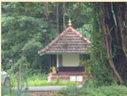
Pilicode Kottumpuram - Sree Vairajathan Temple