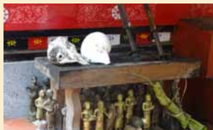
Conch Shell and Bronze Structure, Padaarkulangara Bhagavathy Temple