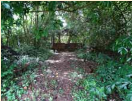
Serpent Grove, Ayyamkunnath Bhagavathy Temple