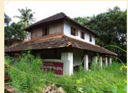
House of the priest