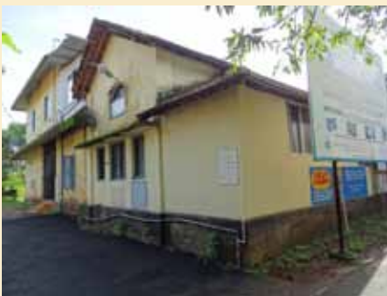
Taluk Hospital, Nileschwaram