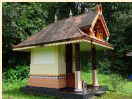
A Munda near the library