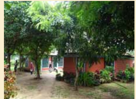
Beautifully maintained, Bekal Fort Beach Park