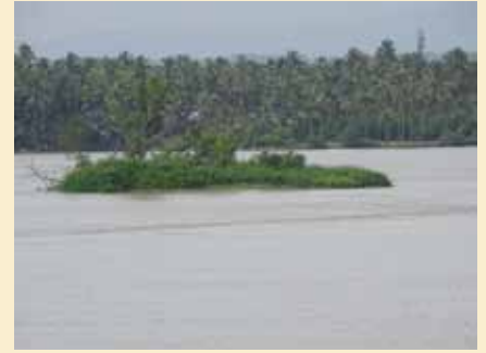
Serene Cheruvathur River