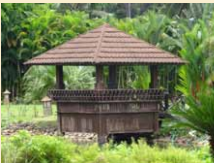
Garden, The Lalit Resort, Bekal