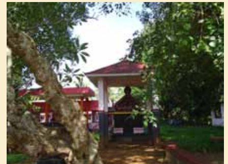
Sree Kottanachery Temple views