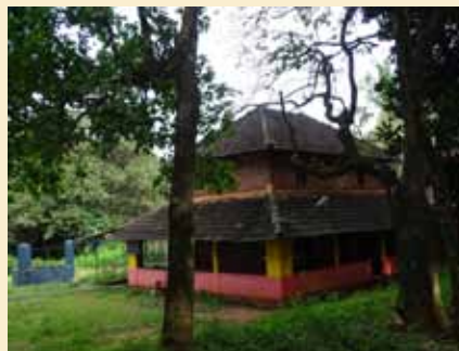
Ancestral home near Vaniyillam Someswari Temple