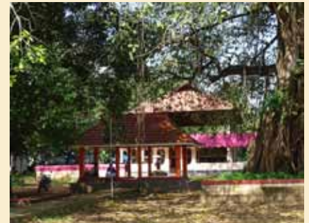
Vellur Sree Kudakkath Kottanachery Temple