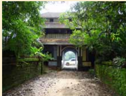
Entrance of Thekke Kovilakam