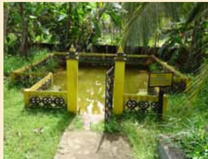
Temple pond, Kalangattambalam