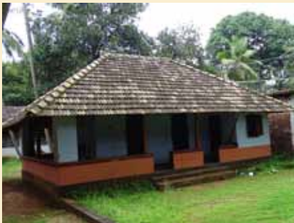
Priest home of Sree Puliakkatt Vishnumoorthy Temple