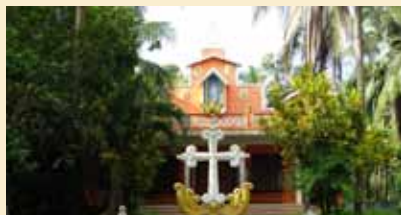
St. Mary's Church