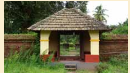
Entrance of Sree Veerabhadra Temple