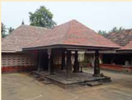
Shrine inside the temple