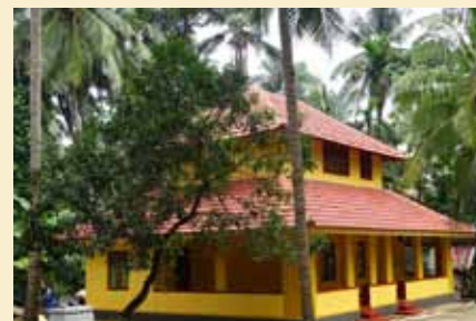
A heritage house model