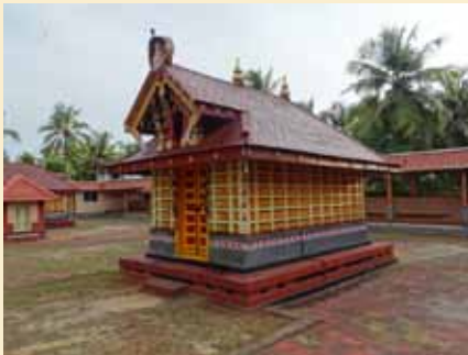
Sanctum Sanatorium of Sree Vaikunda Temple