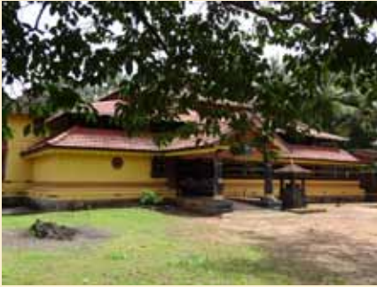
Kuttamath Ponmalam Sri Vishnumurthy Temple, Cheruvathur