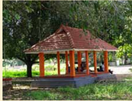
Entrance Mandapam of the temple