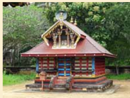
Chandra Muchilott Bhagavathy Temple