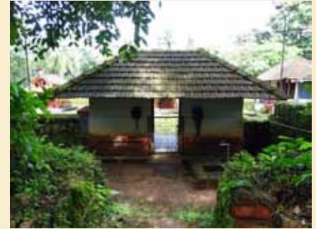
Entrance gate to the temple