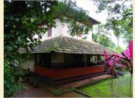
Heritage house near Kovilakam