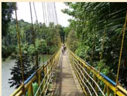
Andol Hanging Bridge