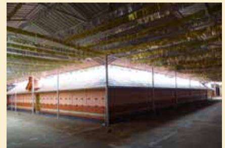
Sree Panchalingeshwara Temple, Kundamkuzhy