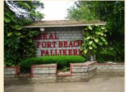
Entrance to Bekal Fort Beach, Pallikere