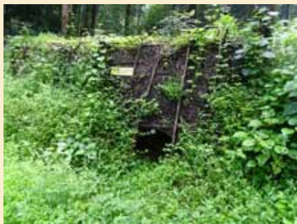
Moolasthanam of Muthappan