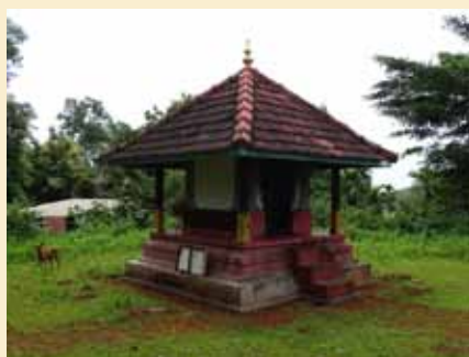
Sree Vairajathan Temple, Kottumpuram