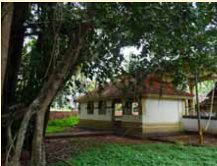
Odhavath Sree Chooliyar Bhagavathy Temple