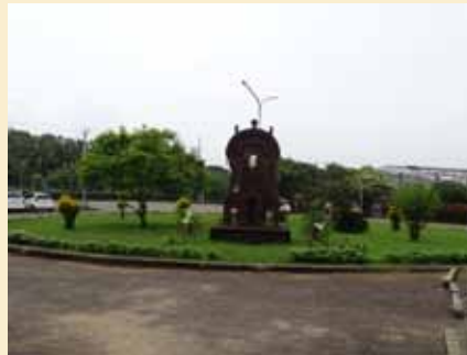
Bekal Fort Beach Park