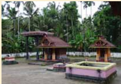
Angakalari Sree Vettaikorumakan Kottaram Padaarkulangara Bhagavathy Temple