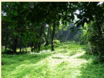
Green Haven of Muthappan at Kunnathurpadi