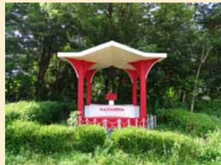
Kunjambu Memorial, Karivellur