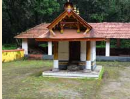
Sub deities temple