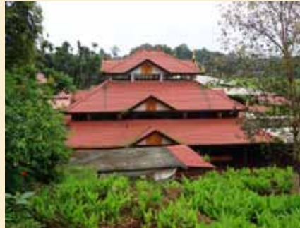
Cheemeni Sree Vishnumoorthy Temple