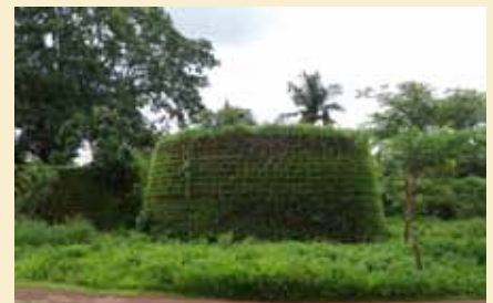
Ruins of an old fort, Kudamkuzhy