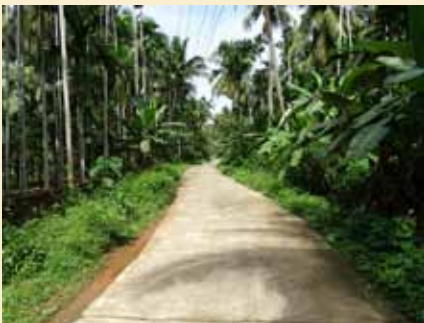
Walkway to the temple