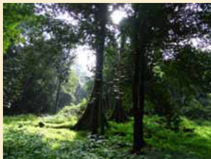
One with nature