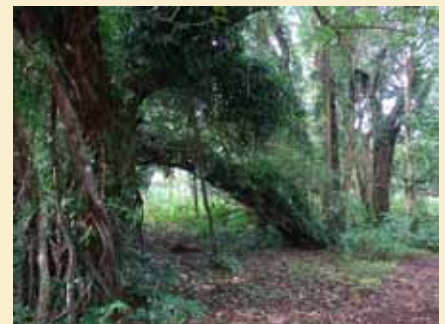
Serpent grove, Vaniyillam Someswari Temple