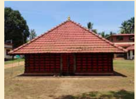
Ashtamachal Bhagavathy Temple