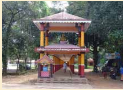
Sree Kurumba Bhagavathy Temple, Kandoth