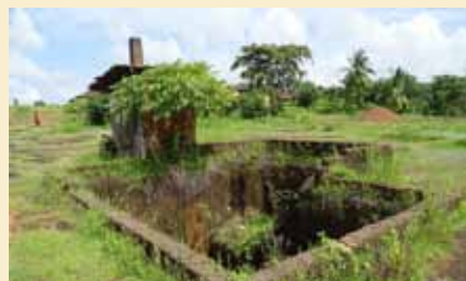
Ruins of an old fort, Kudamkuzhy