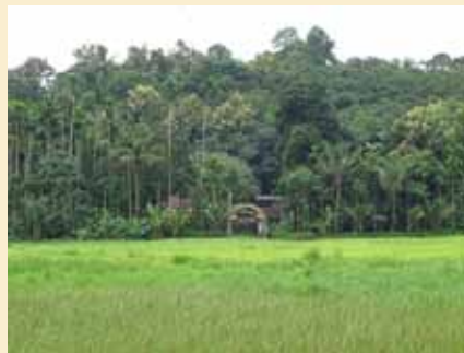
Paddy Fields at Cheemeni