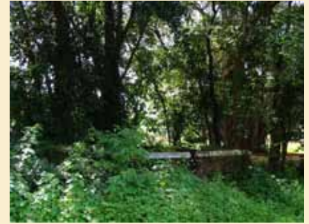
Serpent Grove of the temple