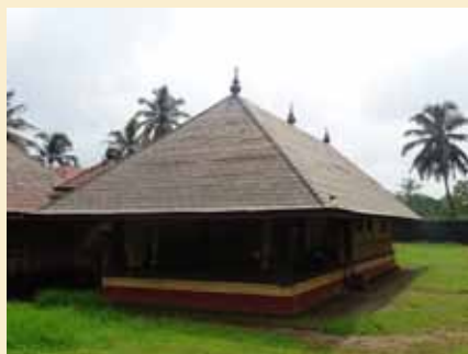
Koothumadam or Traditional performing stage