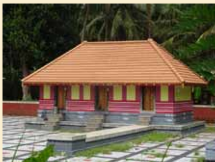
Shrines of Thayathuveedu Tharavaadu Temple