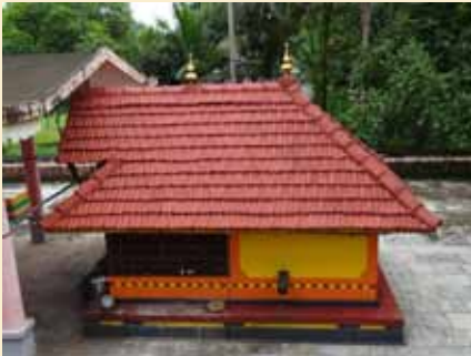
Top view of Pilicode Sree Someswary Temple