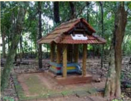
Palakkattu Thutyaparambathu Bhagavathy Temple