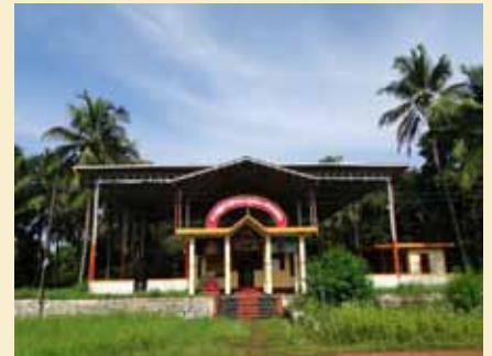
Sree Kozhunthumpadi Temple