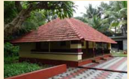
Venkat Tharavaadu House