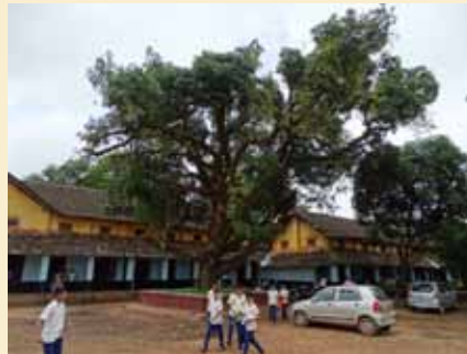
100 year's old Mango tree inside the school campus