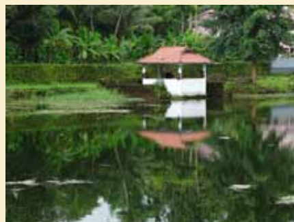
Pond near Thekke Kovilakam