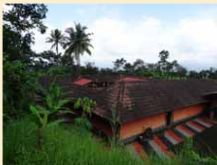
Panoramic view of Kunnathurpadi Muthappan Devasthanam