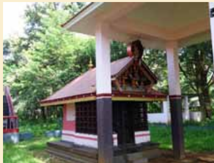
Sub deity of Sree Kottanachery Temple