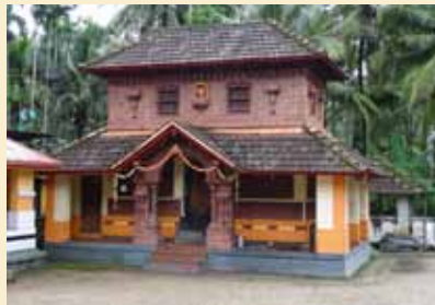
Angakalari Sree Vettaikorumakan Kottaram