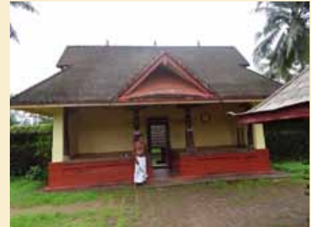
Entrance gateway of the temple