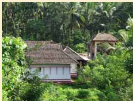
Top view of Kodoth Tharavaadu Meethmala House