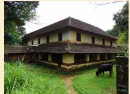
Thekke Kovilakam View