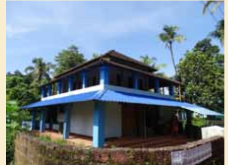
Heritage House at Puthiyatheru