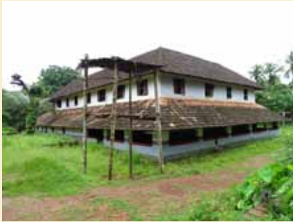
Kakkat Madathil Kovilakam