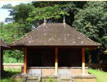
Sub deity shrine, Sree Porkkali Kavv