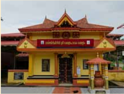
Madathinkeezhil Sree Kshetrapalaka Temple