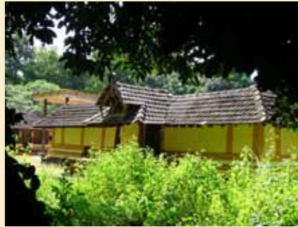
Chamakkavu Temple at Vellur