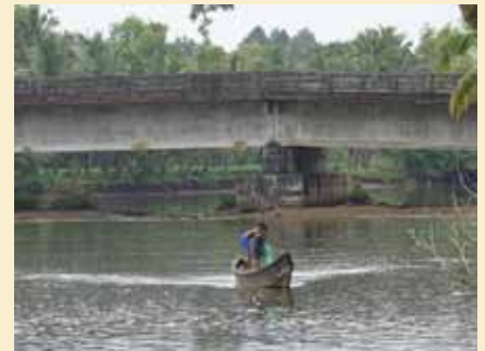
New bridge over Kavvayi river