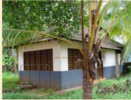
Sub-deity, Sree Kuruvappalli Ara