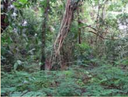
Sree Mannampurathu Kavu Bhagavathy Temple