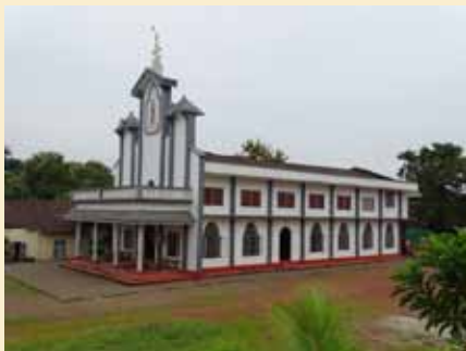
St. Antony's Church, Cheemeni