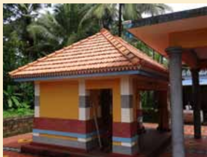
Sub-deity shrine, Thayathuveedu Tharavaadu Temple