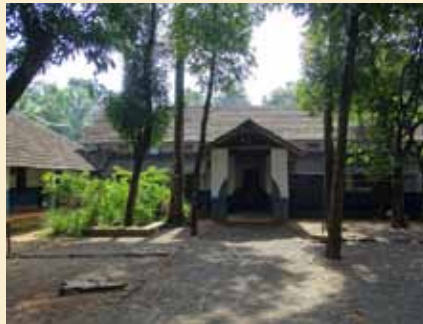
Chandan Memorial ALP School, Vellur