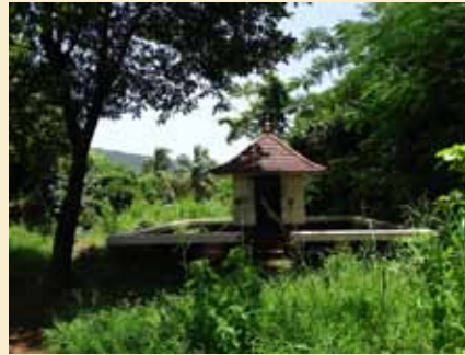
Ettikulam Valiya Bhagavathy Temple