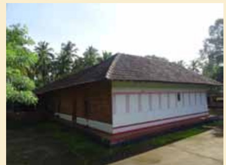
From back, Tharavaadu Temple of Kodoth