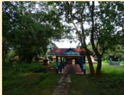
Vaniyillam Someswari Temple, Karivellur