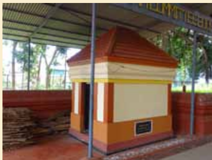
Sub-deity shrine of Chirappan