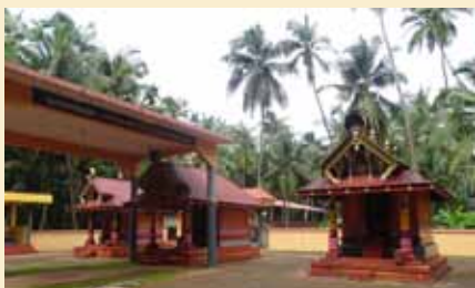
Padaarkulangara Bhagavathy Temple