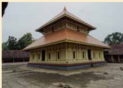
Another view of Sanctum Sanatorium