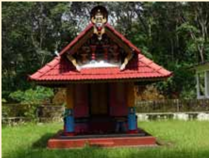
Andol Kunnummal Puthiyarakkaal Cheralath Bhagavathy Temple