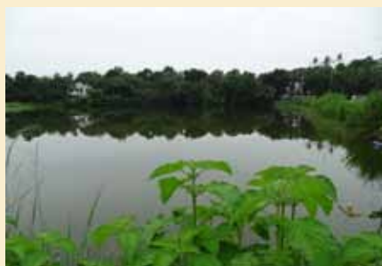
Pond adjoining Sree Chakrapani Temple