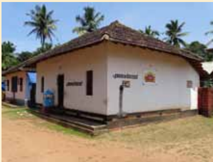
Puthankudi Tharavaadu (Family)