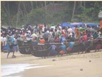
Fishermen and fishing boat