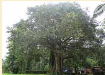
Banyan Tree in front of the temple