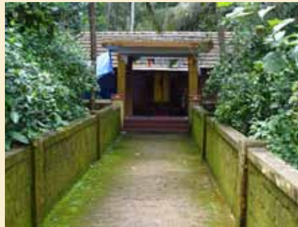
Sri Kaitheri Edam Bhagavathy Temple