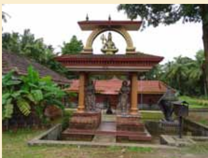
Entrance gateway of the Shiva Temple