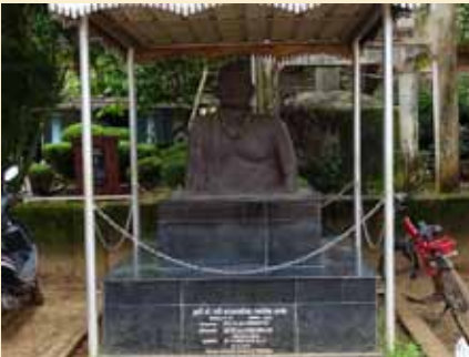
Sri. T.C. Ramavarma Valiya Raja Memorial