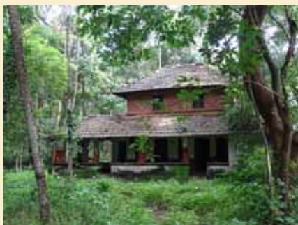
Heritage home, Karivellur