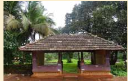
Eastern Entrance of the temple