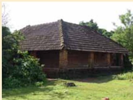
A heritage house