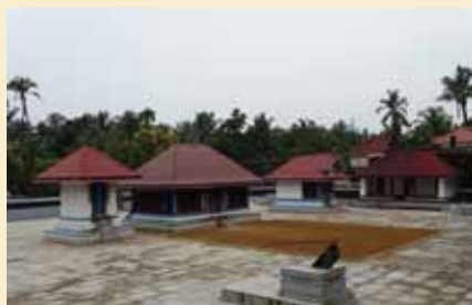
Overview of Lord Rama Temple