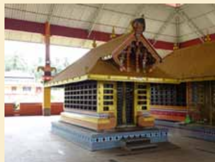
Shrine inside Palakkunnu Bhagavathy Temple