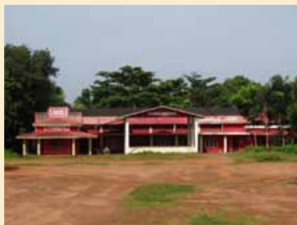
Martyr's Memorial, Karivellur