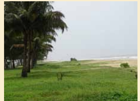
Coconut trees on Bekal beach shore