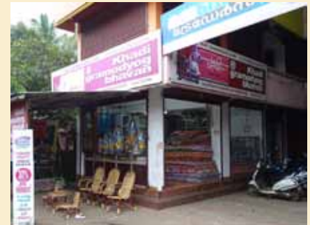
Khadi Board Outlet