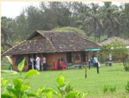
Bekal Fort Beach Park building