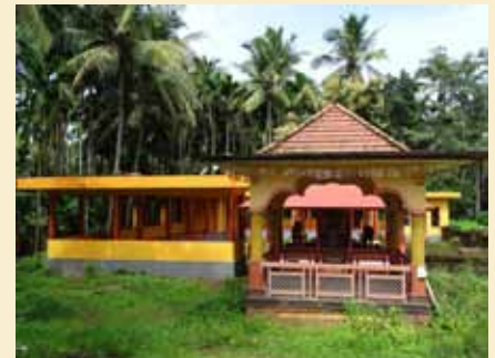
Sree Meledath Poomaala Bhagavathy Kavu