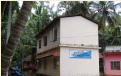
E.K Nayanar Memorial, Library