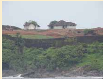
Heritage building inside Bekal fort