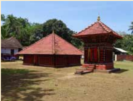
Ashtamachal Bhagavathy Kavu