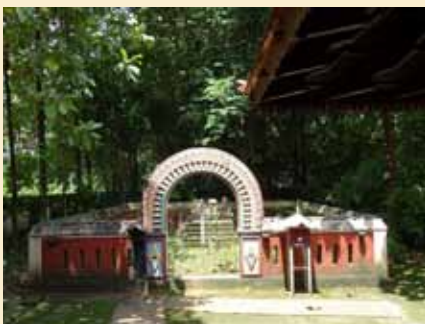
Serpent Grove, Ashtamachal Bhagavathy Temple