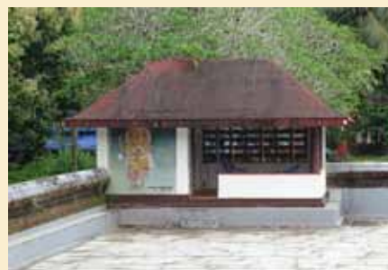
Model of Veerabhadran Theyyam