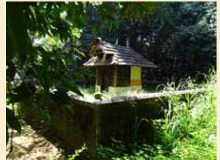
Sub-deity at Chamakkavu Temple