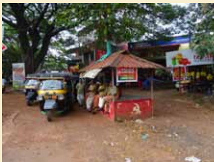
Auto Stand, Karivellur