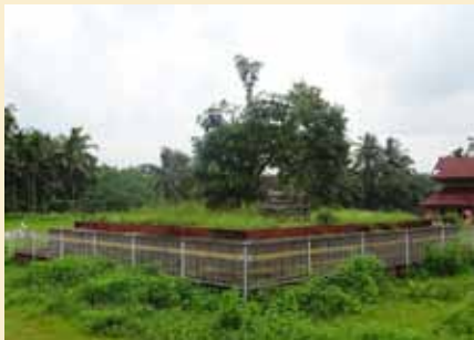
Serpent shrine, Madiyan Koolam Temple