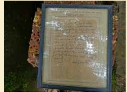
Gandhiji's message at Rajah's School, Nileschwaram