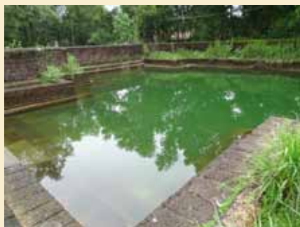
Temple Pond, Chandra Muchilott Bhagavathy Temple