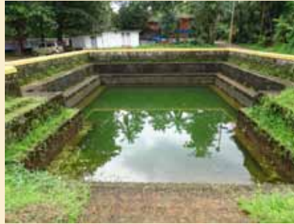
Temple Pond of Madathinkeezhil Sree Kshetrapalaka Temple