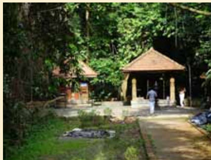
Sree Mookambika Temple & Sacred Grove at Paliyeri