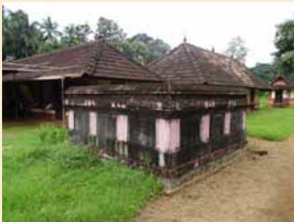
Madiyan Koolam Temple views