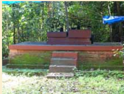
Shrines inside the temple