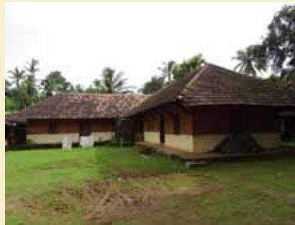
Thekke Kovilakam, Nileshwaram