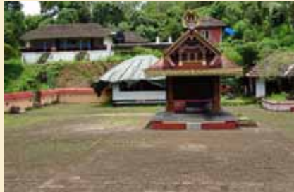
Bhagavathy Vettaikorumakan Temple, Chathamath