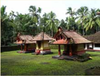
Pothavoor Sree Meledath Poomaala Bhagavathy Kavu Munda