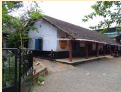
GLP School, Nileschwaram