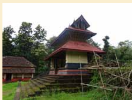
Madiyan Koolam Temple