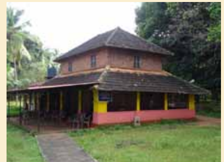
Vaniyillam Ancestral home