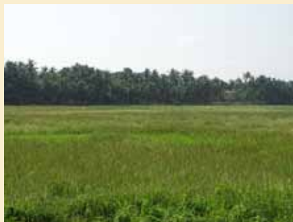
Paddy field, Karivellur