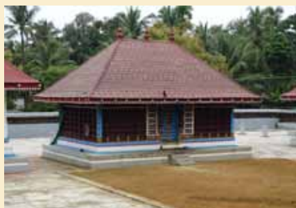
Lord Rama Temple, Thankayam