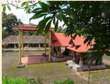
Top view of the temple