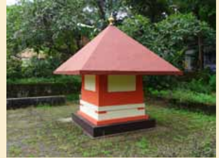
Sub-deity shrine of the temple