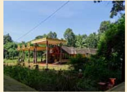
Outside view of Chamakkavu Temple