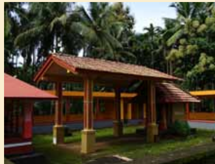
Sree Meledath Poomaala Bhagavathy Kavu