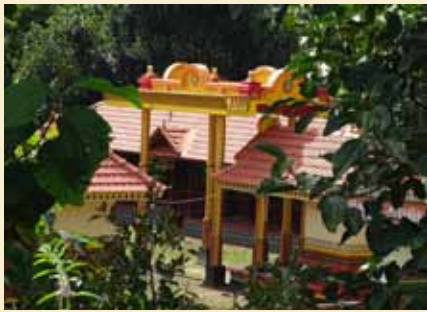
From top, Kalarathri Bhagavathy Temple, Kolathur