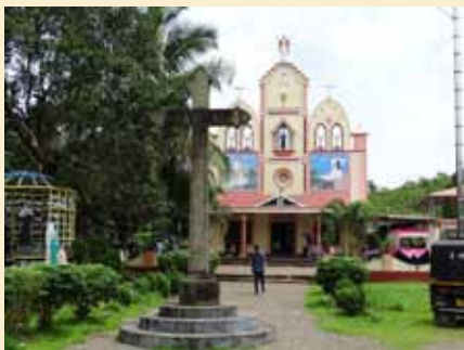
St. Alphonsa Church, Chayyoth