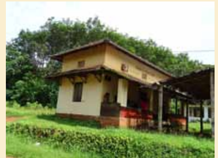
Andol Deshasevini Library