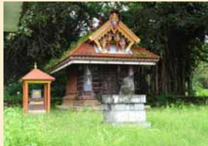
Kunjalinkeezhil Temple, Olavara