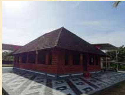
Mandapam inside the temple