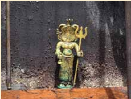
Vayanattu Kulavan Bronze Statue