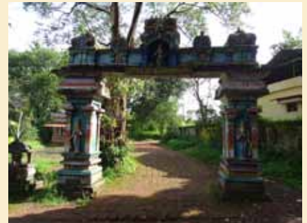
Sree Maheshwari Temple, Perole