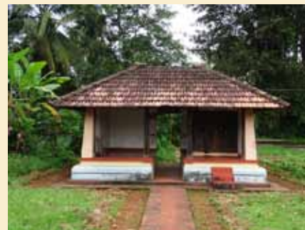
Entrance gateway to the temple