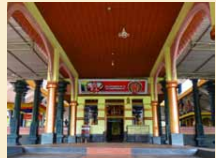
Front view of the temple