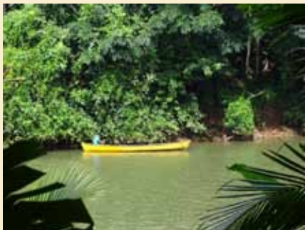
Fishing boat at Thejaswini River