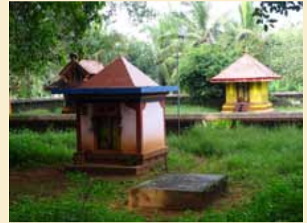
Vaniyillam Someswari Temple