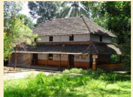
Priest home of Kandoth Sree Kurumba Bhagavathy