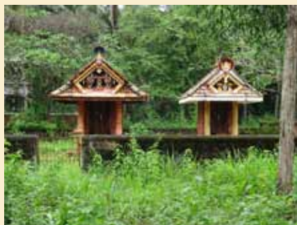
Sub-deity shrines, Chandra Muchilott Bhagavathy Temple