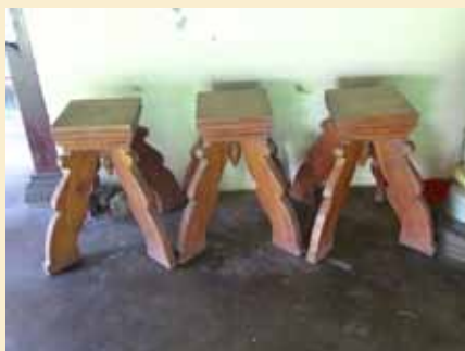
Theyyam performing stool