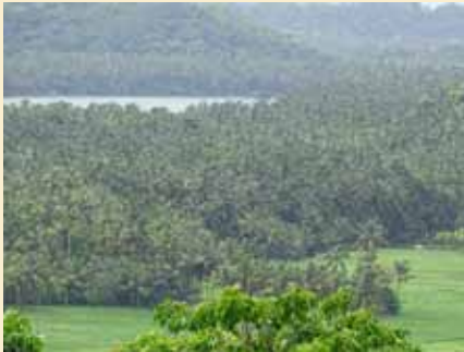
Coconut groves and Thejaswini River