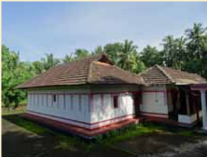
Kodoth Tharavaadu Temple