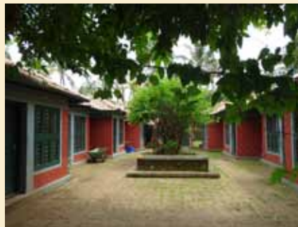
Cottages inside Bekal Fort Beach Park