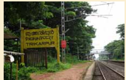
Trikkarippur Railway Station