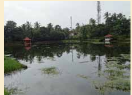
Chira or Pond near Thekke Kovilakam