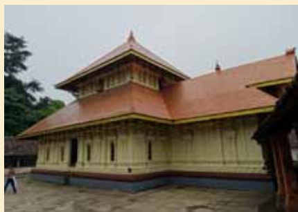
Sanctum Sanatorium of Sree Chakrapani Temple