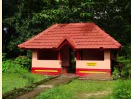
Sub-deity, Mannampurathu Kavu