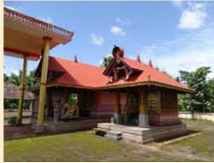
Sree Thamburatti Bhagavathi Temple, Kuttikol