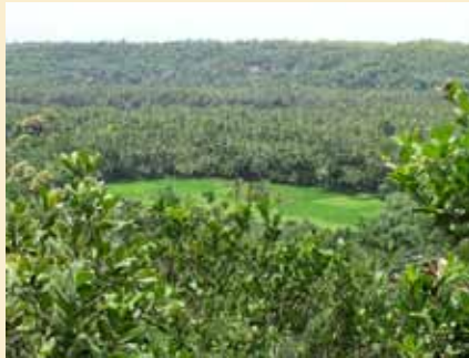
Paddy fields and Coconut trees