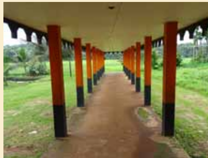
Walkway to the temple