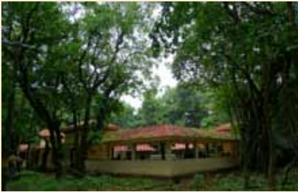
Outside view, Sree Olavara Mundyakavu Temple