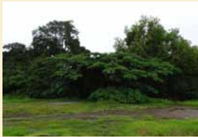
Serpent Grove, Padaarkulangara Bhagavathy Temple