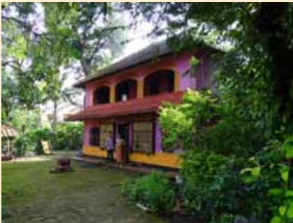
Heritage House at Perole