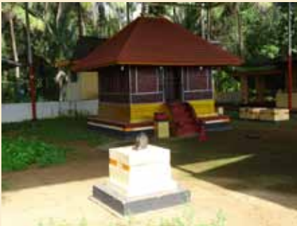
Sree Kozhunthumpadi Kavu