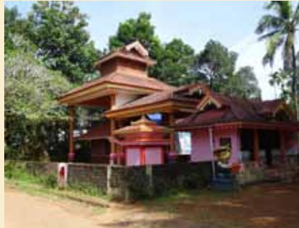
Chamundeswari Devasthanam, Puthiyatheru