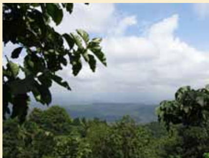
Hills of Payyavvoor