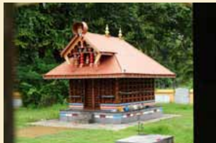
Another view of Manakkad Bhagavathy Temple