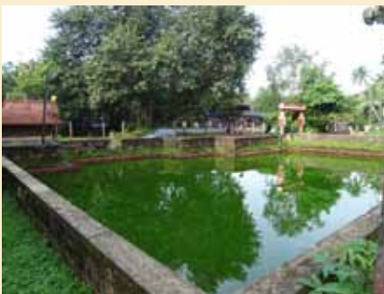
Madappally Someswari Temple Pond