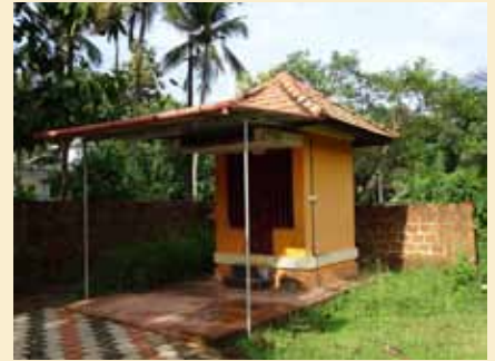
Sub-deity shrine, Sree Gopalakrishna Temple