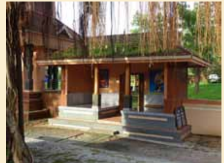
Side way entrance to the temple