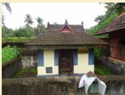
Shrine of Perattur Bhagavathy