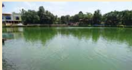
Temple Pond, Payyanur Subrahmanya Temple