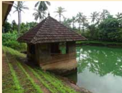
Temple pond of Madiyan Koolam