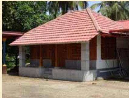
Bhagavathy Temple, Ashtamachal