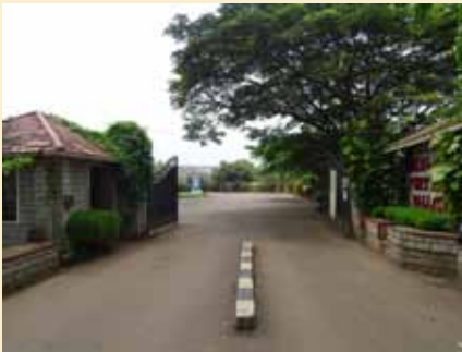
Entrance gateway to Bekal Fort Beach