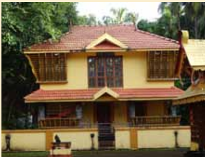
Temple Complex, Sree Arayil Bhagavathy Devalayam,