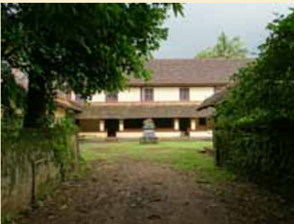
Front View of Thekke Kovilakam