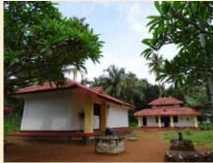
Padinjhattam Kozhuval Sree Puliyakkat Yogi Madam