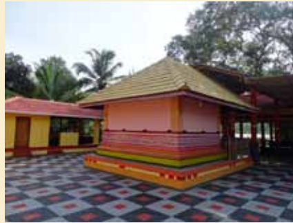
Sree Chooliyar Bhagavathy Temple, Kundamkuzhi Nagaram Verikkulam