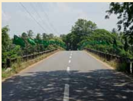
Punnakadavu Bridge, Payyanur