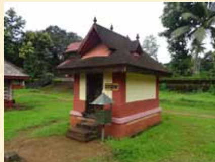
Shrine of Manjalamma