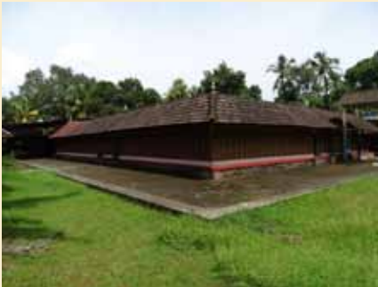
Kuttamath Bhagavathy Temple