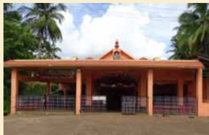
Front view of Sree Panchalingeshwara Temple