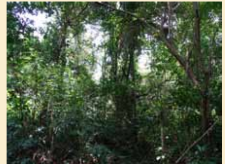
Sacred Grove of the temple