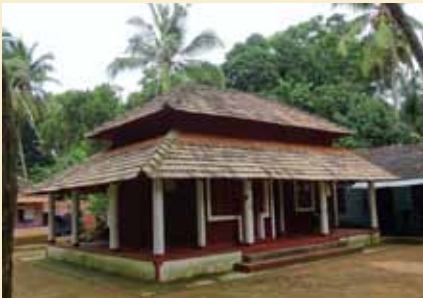
Olavara Vadakke Veedu Tharavaadu