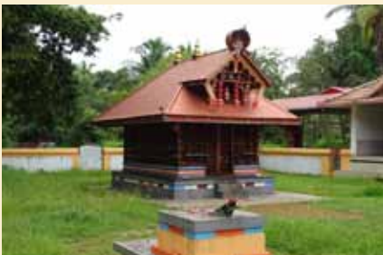
Manakkad Bhagavathy Temple