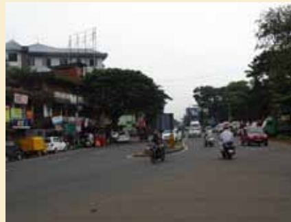
Puthiyatheru near Chirakkal