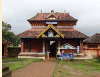
Thaliyil Sreekanteshwara Temple