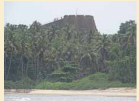
Imposing Bekal Fort