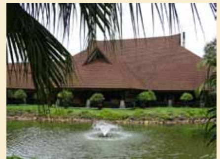
The Lalit Resort, Bekal