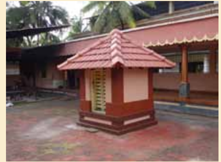
Sub-deity shrine, Sree Vaikunda Temple