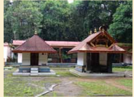
Sub deities temple