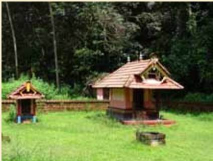
Kavuthithottu Bhagavathy Temple