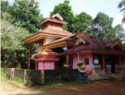
Sree Chamundeswari Temple, Puthiyatheru