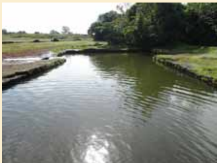
Serpent grove and pond, Kodoth