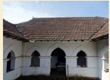
Kodoth Tharavaadu House