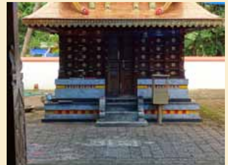
Sub-deity shrine, Anjootambalam Veererkavu Temple