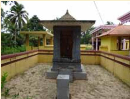
Nadakkavu Kovval Mundy Devasthanam