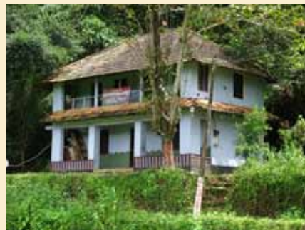
Parakkol. K Narayanan Memorial Library