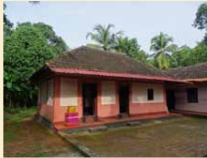
An ancestral home, Karivellur