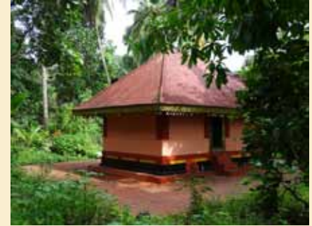
Another Sub-deity, Mannampurathu Kavu