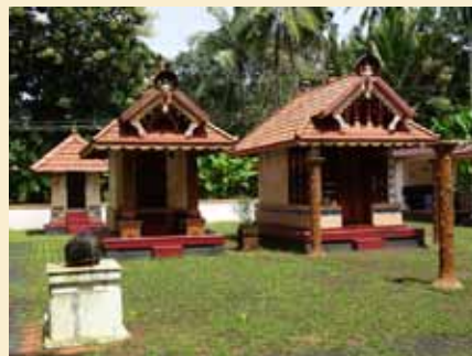
Keezhmala Puthiyasthanam Poomala Bhagavathy Temple