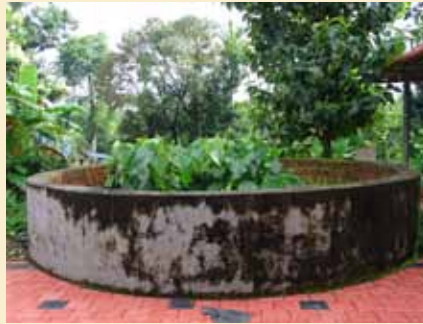
Sree Gopalakrishna Temple views