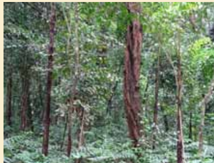
Sacred Grove of Palakkattu