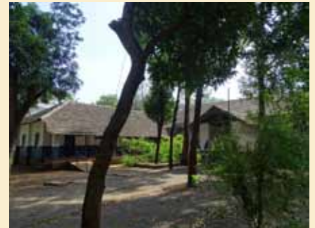
Chandan Memorial School