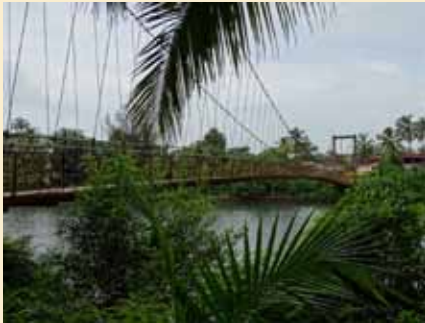
Padannakkad Hanging Bridge