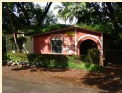
Village Office, Perole