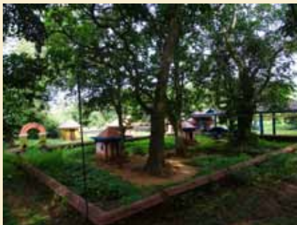
Karivellur Vaniyillam Someswari Temple