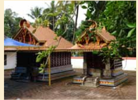
Anjootambalam Veererkavu Temple