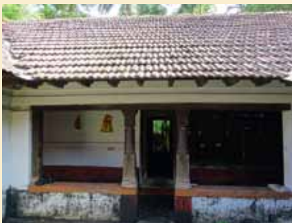
Family deity worship place of Kodoth Tharavaadu