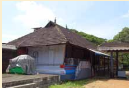
Entrance of Subrahmanya Swami Temple