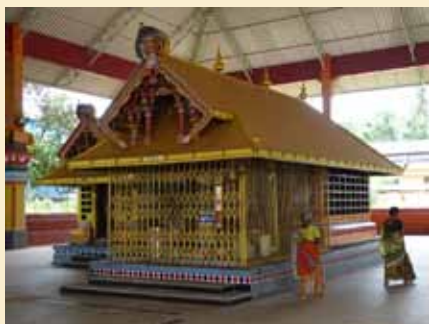
Palakkunnu Bhagavathy Temple