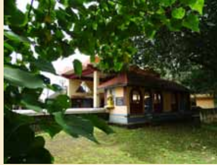
Sree Kurumba Bhagavathy Temple