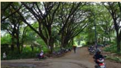
On the way to Trikkarippur Railway Station