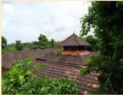
Bird's eye view of Ayyamkunnath Bhagavathy Temple