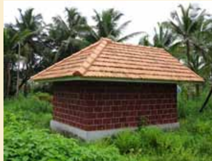
Thalichalam Mundyathalinkeezhil Vishnumoorthy Temple