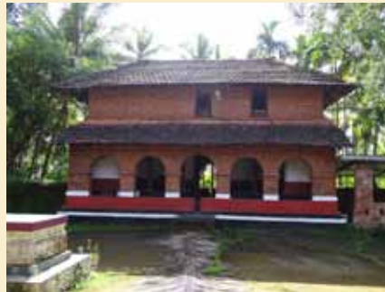
Kodoth Tharavaadu entrance