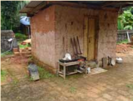
Temporary shrine, Sree Chooliyar Bhagavathy Temple