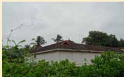
Sree Shasthamangalathappam Shiva Temple, Poovalamkai