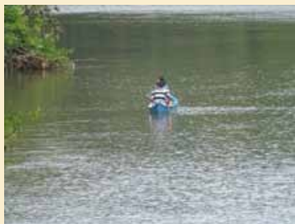
Fishing boat at Thejaswini River