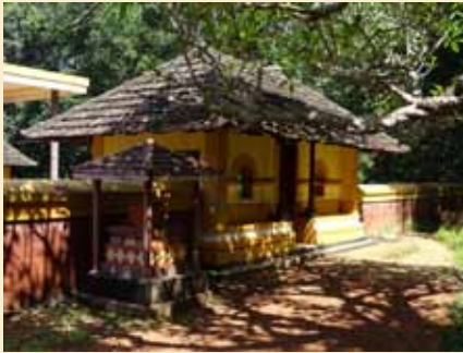
Entrance of Chamakkavu Temple