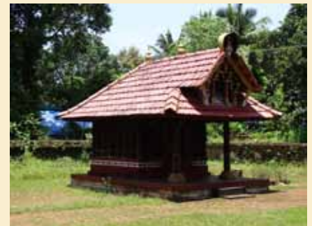
Padinjattu Puthiya Bhagavathy