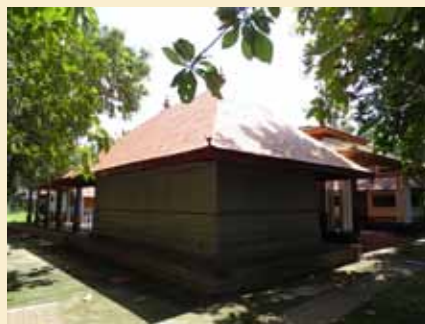
Ashtamachal Bhagavathy Temple Views