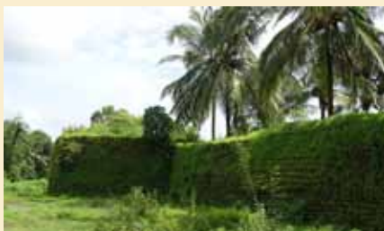
Ruins of an old fort