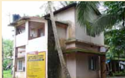
Library dedicated to E.K Nayanar