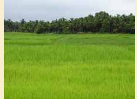
Paddy fields, Kozhuval