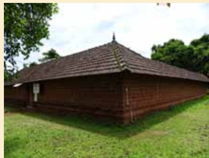
Ayyamkunnath Bhagavathy Temple, Kasaragod