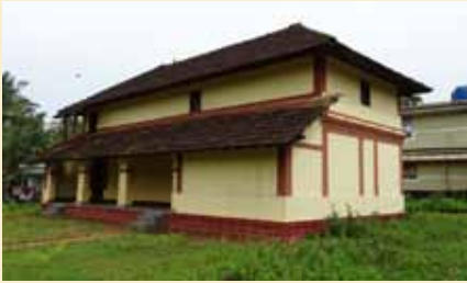
Kadamkodu Kottaram Vathukkal Vishnumoorthy Temple