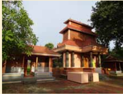
Entrance gateway of Sree Vaikunda Temple