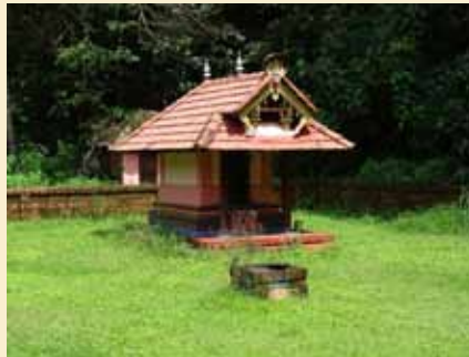
Kavuthithottu Bhagavathy Temple