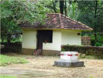
Palakkattu Vadakkekallari Vayalil Bhagavathy Temple