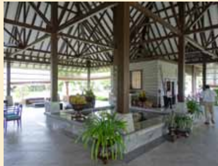
The Lalit Resort, Bekal