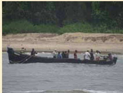
Fishing boat in Bekal beach