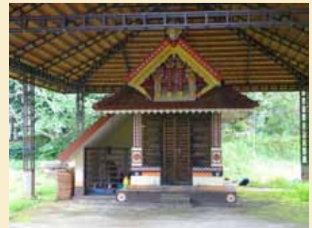
A temple in Thankayam