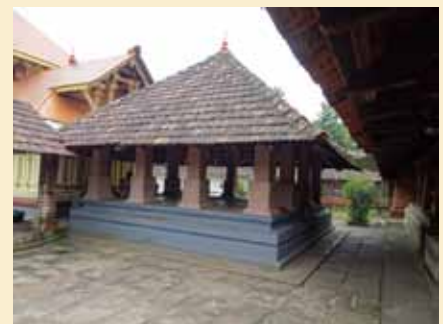
Namasakara Mandapam, Sree Chakrapani Temple