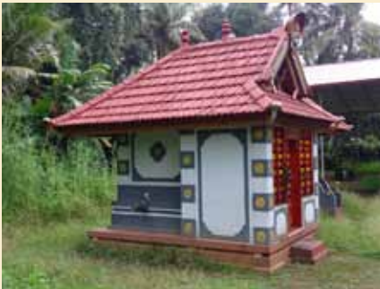
A small shrine