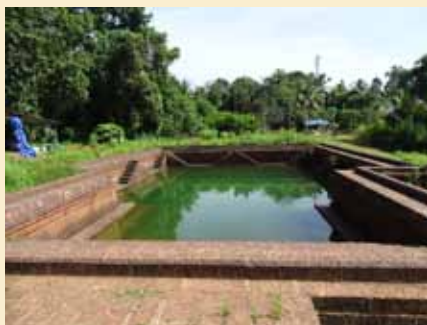
Temple pond of Sree Kottanachery Temple