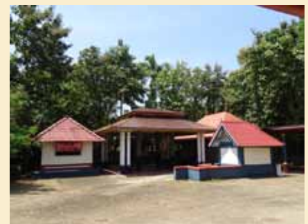
Ashtamachal Bhagavathy Temple Outside view