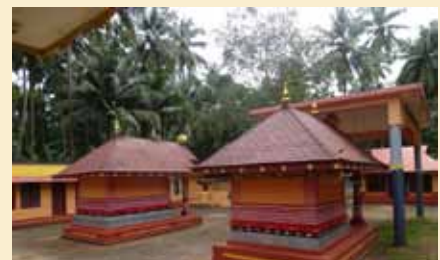
From Back, Padaarkulangara Bhagavathy Temple