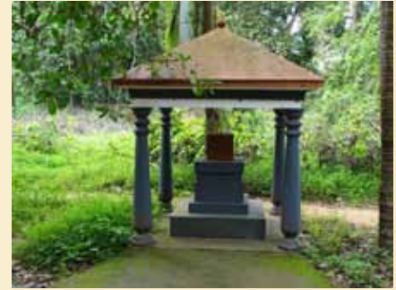
Devasthanam, Sree Kuruvappalli Ara