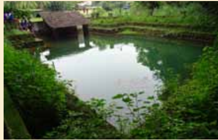
Temple pond, Sree Olavara Mundyakavu Temple