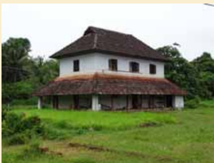
Chakarapani Temple Kottaram