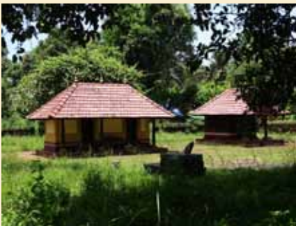
Padinjattu Puthiya Bhagavathy Temple