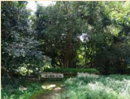
Serpent Grove of Chamakkavu Temple