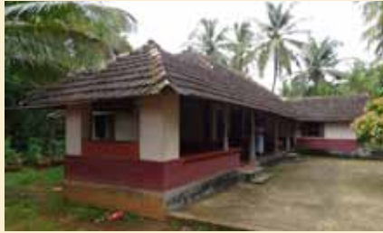
Heritage Home, Kadamkodu