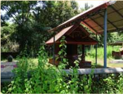
Sree Puthiya Bhagavathy Temple