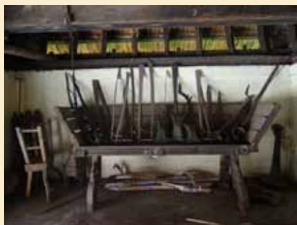
Swords of Various Theyyam