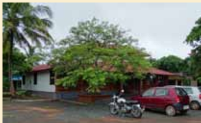
Kavilbhavan Yoga and Nature Cure Centre