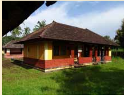
Panayal Perunthatta Chamundeshwari Devasthanam