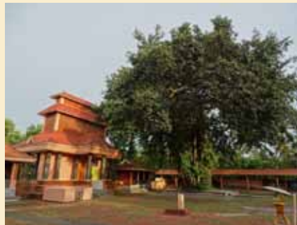
Sree Vaikunda Temple, Kottappuram