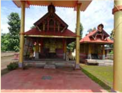
Sree Thamburatti Bhagavathi Temple, Kuttikol