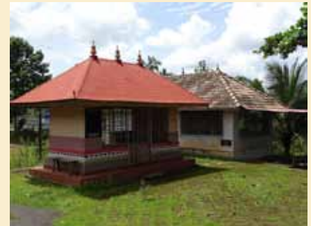
On the way to Kuttikol Temple