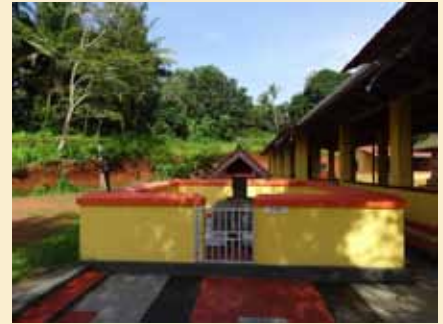
Shrine of Gulikan