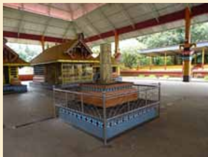
View of Palakkunnu Bhagavathy Temple