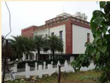
J K Residency - business hotel