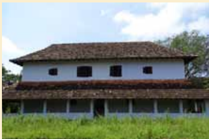
Dining hall of Subrahmanya Swami Temple