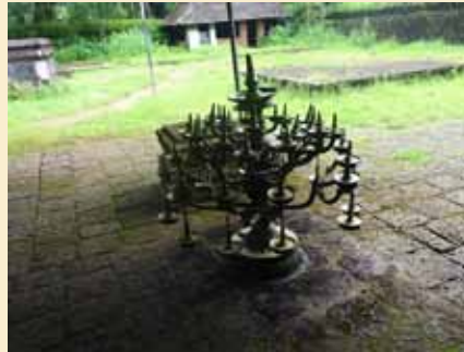
Traditional bronze lamp or Vilakku