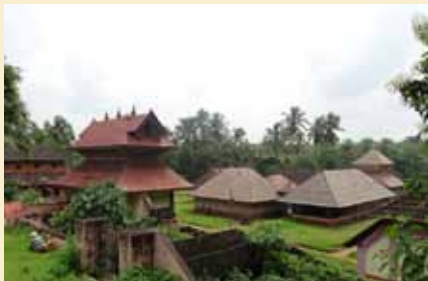
Sree Madiyan Koolam Temple, Kanhangad