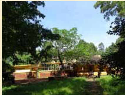
Sree Chamakkavu Temple