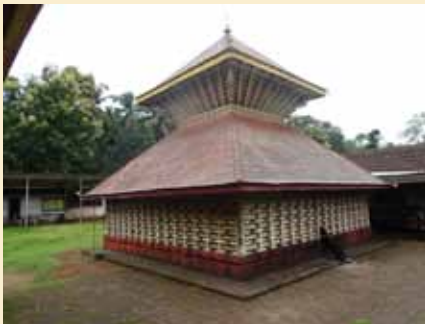
Sanctum Sanatorium of the temple