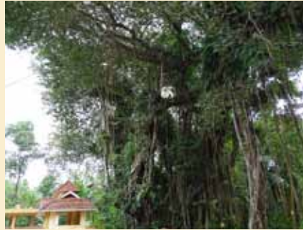
Huge Banyan Tree in front of the temple