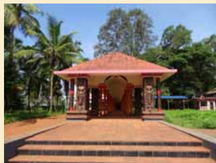
Sree Kottanachery Temple Corridor