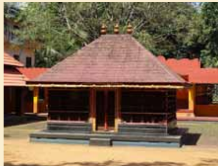
Main Temple of Kandoth Sree Kurumba Bhagavathy