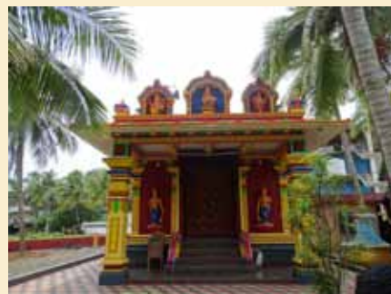
Ayyappa Temple, Udma