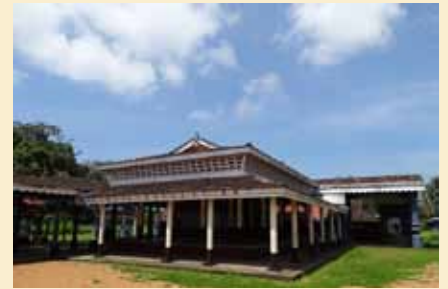
Outside view of Subrahmanya Swami Temple