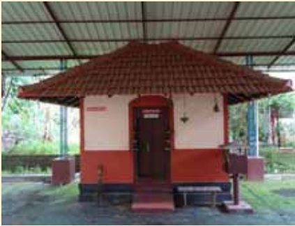
Kunjaar Kurathi Temple, Kottilaveedu Tharavaadu