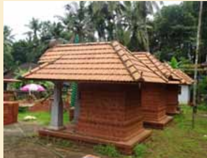
New temple structures on construction