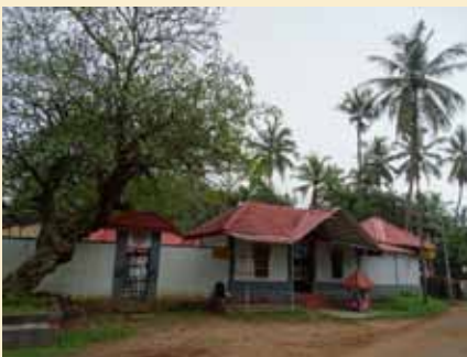
Sree Kurumba Bhagavathy Temple