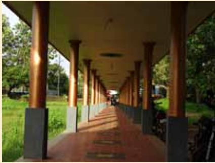
Temple Corridor, Sree Vaikunda Temple