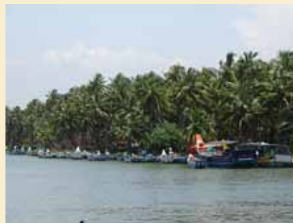
Palakkode Fishing boats