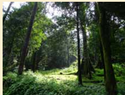
Respecting the nature, surroundings of Muthappan Temple