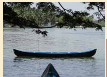
Fishing boat at Palakkode River