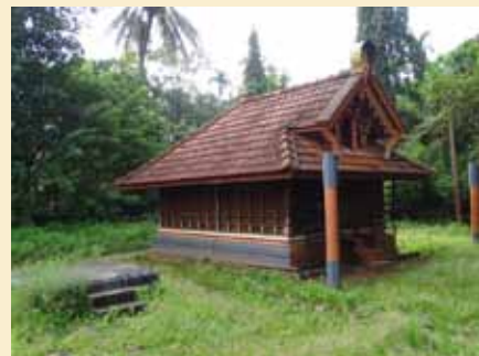
Madappally Someswari Temple