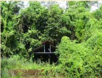
Serpent Grove, Sree Kozhunthumpadi Temple