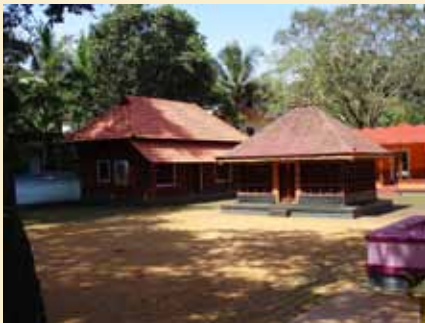
Kandoth Sree Kurumba Bhagavathy Temple