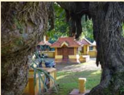
Kanhangad Theruvath Sree Arayil Bhagavathy Devalayam,