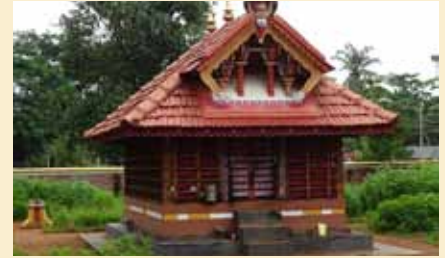
Muchilott Bhagavathy Temple