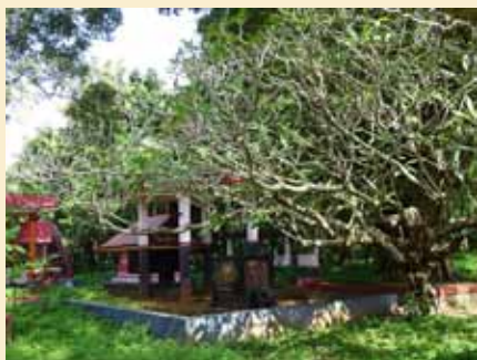
Kavu at Sree Kottanachery Temple