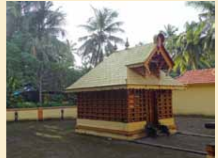
Main Temple of Sree Arayil Bhagavathy Devalayam,