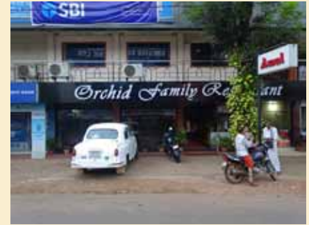
Restaurant at Puthiyatheru