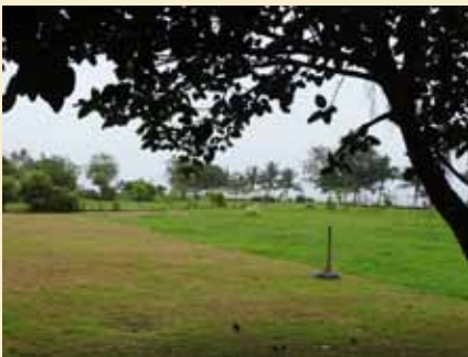
Lawn inside Bekal Fort Beach Park