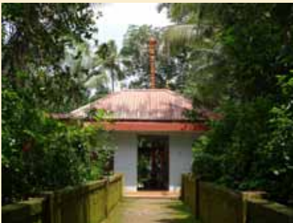
Kodimaram (Flag staff) of the temple