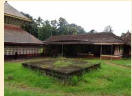
Madiyan Koolam Temple ground