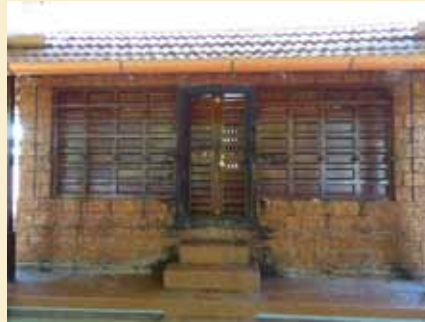
Shrine inside the temple ground