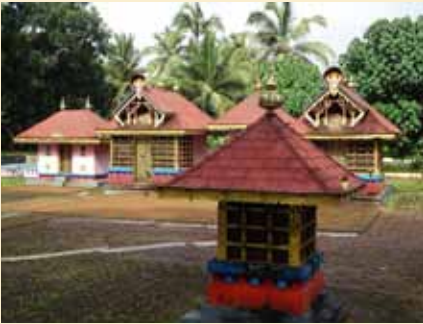
Kadanje Kadavu Aryakkara Bhagavathy Temple