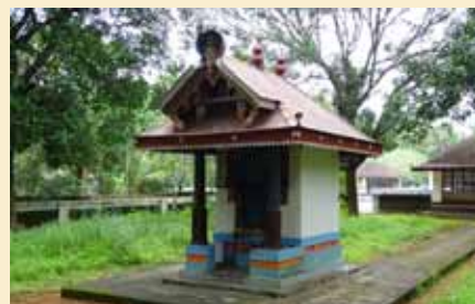
Sub-deity shrine, Lord Rama Temple