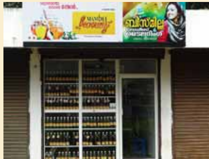
Honey Sales Outlet, Thankayam