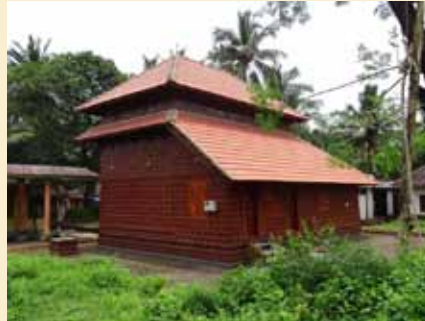
Puthrakkar Tharavadu, Kottikulam