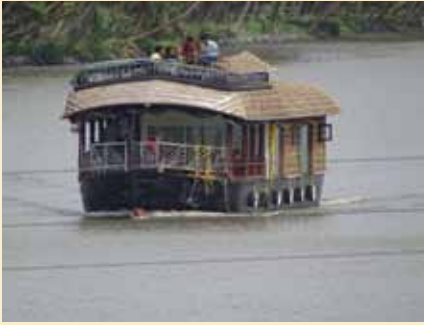
Houseboat cruise, Cheruvathur River