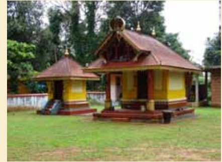
Sree Puliakkatt Vishnumoorthy Temple