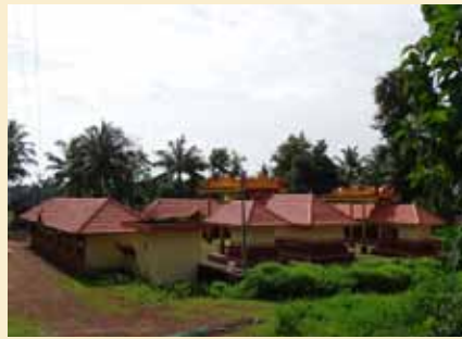
Outside view of Kalarathri Bhagavathy Temple