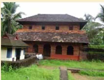
An old palace near the temple