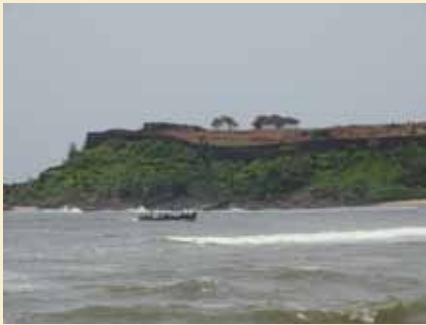
Bekal beach and fort