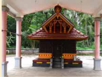
Pilicode Sree Someswary Temple