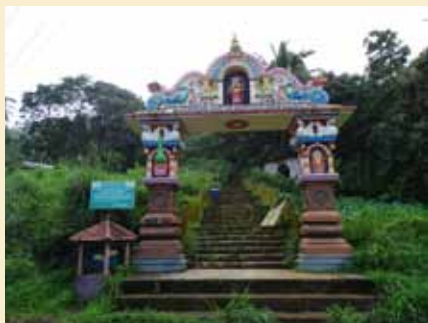
Entrance Kunnathurpadi Muthappan Devasthanam