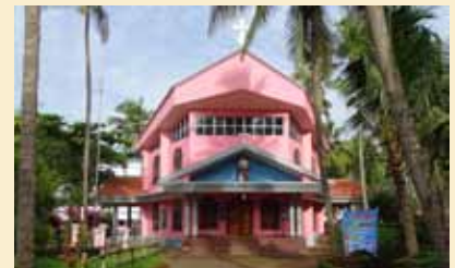
St. Peter's Catholic Church