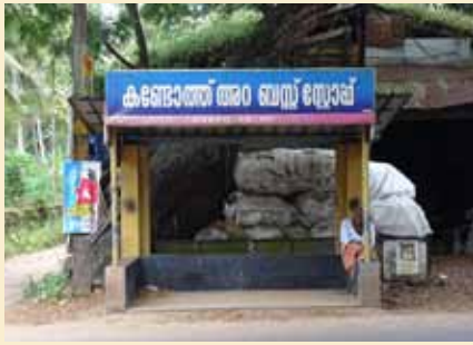
Bus Stop at Kandoth