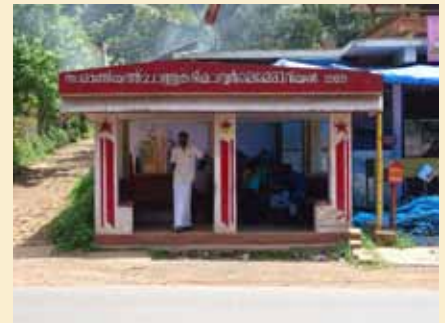
A memorial at Kuthuparamba