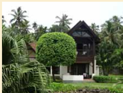
The Lalit Resort, Bekal