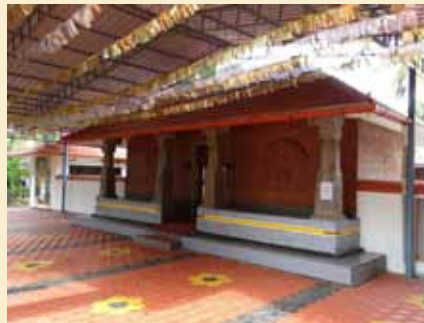
Anjootambalam Veererkavu Temple View