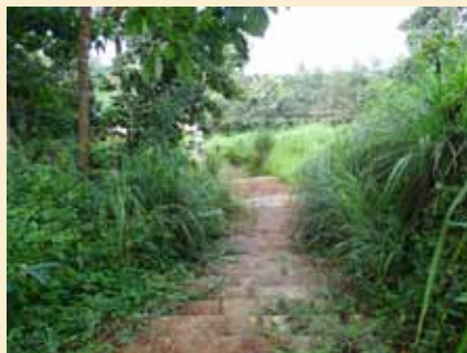
Way to Kunnathurpadi Muthappan Devasthanam