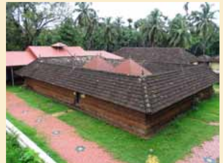
Kakkat Sree Vishnu Temple