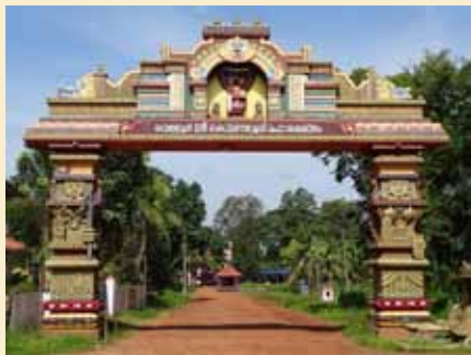
Entrance gateway of Sree Kottanachery Temple