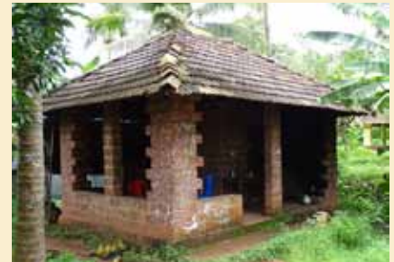
Village Tea Shop, Chathamath