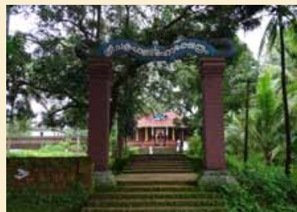
Entrance gateway of Sanctum Sanatorium