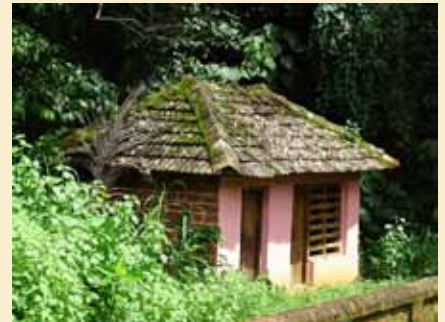
An old building inside, Kavuthithottu Bhagavathy Temple