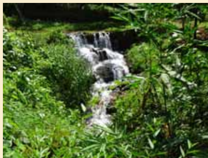
Waterfall near the temple