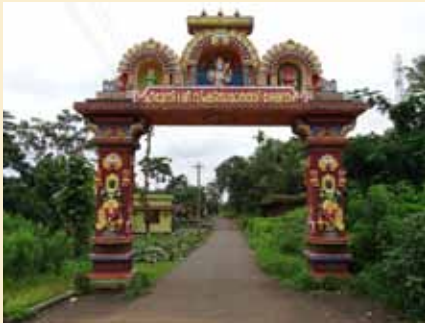
Entrance gateway to Cheemeni Sree Vishnumoorthy Temple