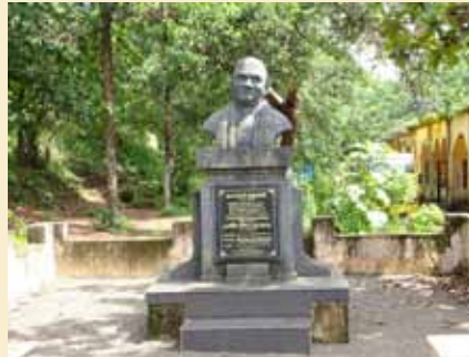
Statue of Mahakavi Kuttamath