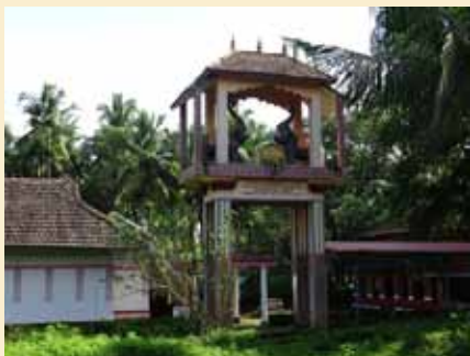
Kodoth Tharavaadu Meethmala House, Verikkulam