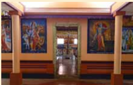
Main deity temple, Sree Panchalingeshwara Temple