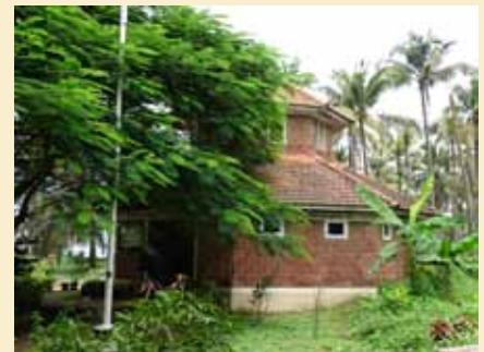
Washroom inside Bekal Fort Beach Park