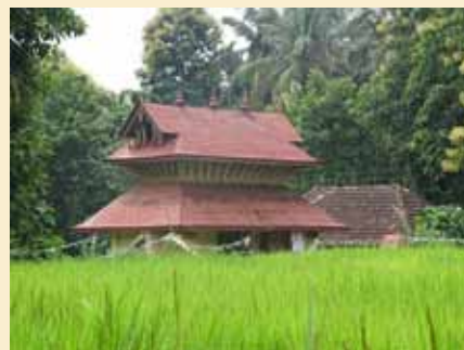
Madiyan Koolam Temple, Outer view