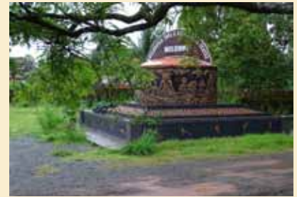
Kavilbhavan Yoga and Nature Cure Centre