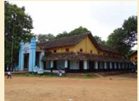
Rajah's Higher Secondary School, Nileschwaram