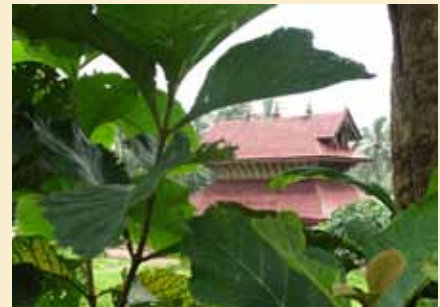
Temple dome of Madiyan Koolam