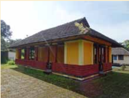
Shrine inside the temple