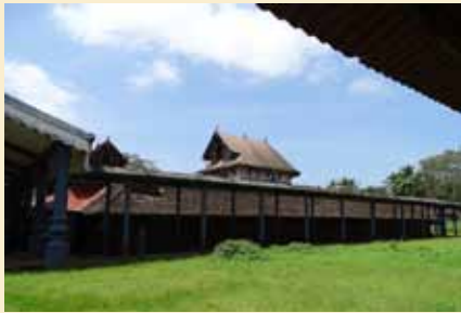
Sree Subrahmanya Swami Temple, Payyanur