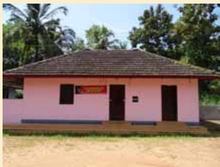
Muranden Tharavaadu (Family)