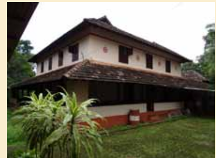
Inside view of Kinavoor Kovilakam