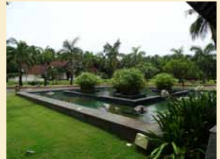
The Lalit Resort, Bekal