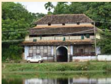
Entrance Structure of Thekke Kovilakam