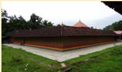
Sree Veerabhadra Temple, Cheruvathur