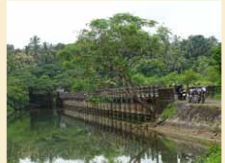
An old bridge near temple