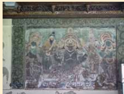
Mural Painting, Madiyan Koolam