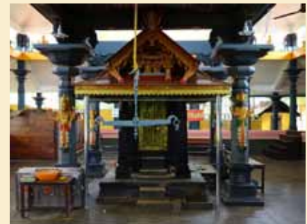
Cheemeni Sree Vishnumoorthy Temple