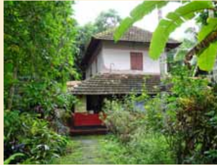
Heritage house near Kovilakam