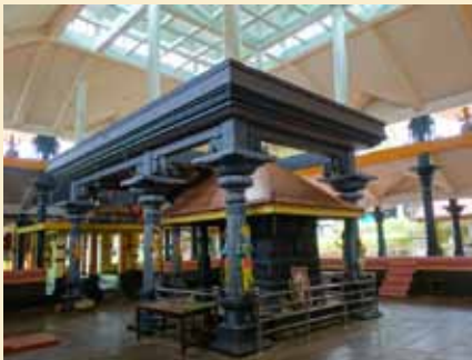
Main temple of Cheemeni Sree Vishnumoorthy Temple