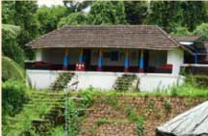
Chathamath Bhagavathy Vettaikorumakan Temple