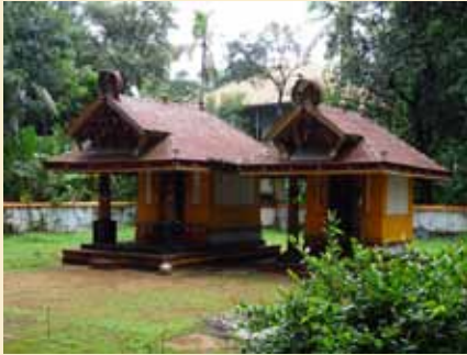
Kootathilara Sree Vishnumoorthy Temple