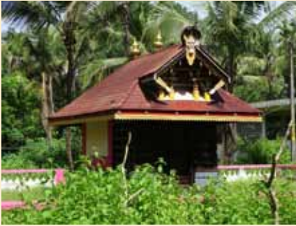
Sree Kudakkath Kottanachery Bhagavathy Temple