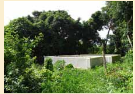
A kavu near Peraladukka