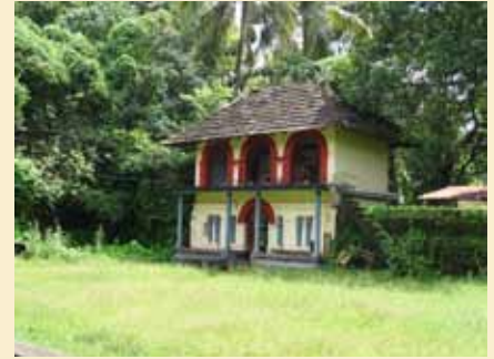
Entrance to Kuttamath Bhagavathy Temple