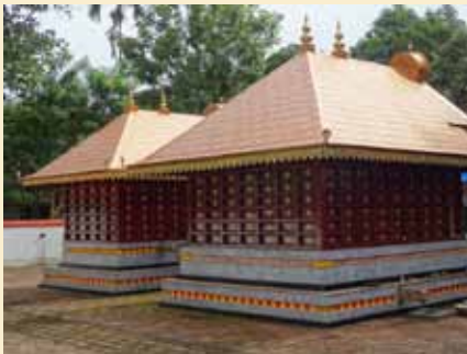
Anjootambalam Veererkavu Temple, Nileschwaram