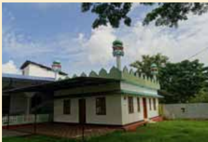
Maruthadukkam Juma Mosque