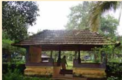
Another entrance of the temple