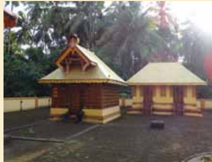
Main Temple and Sub-deities shrine