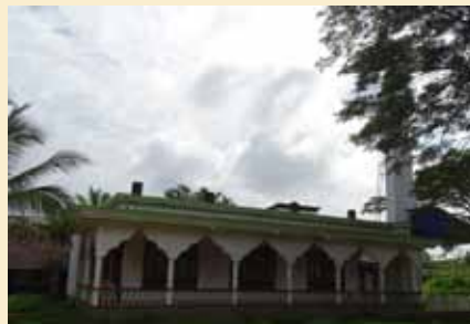
Maruthadukkam Juma Mosque another view