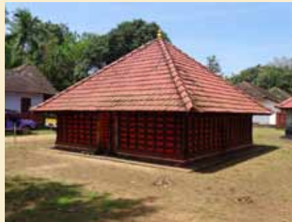
Sub-deity, Ashtamachal Bhagavathy Kavu