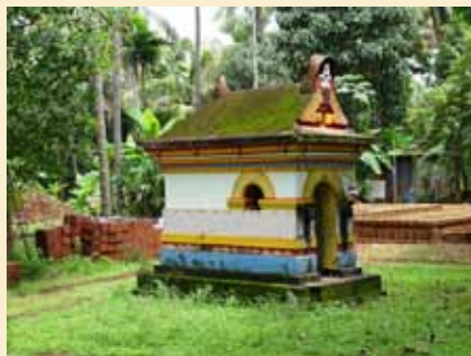
Pottan Kavu at Palathadam