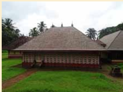
Shrines inside the temple premises