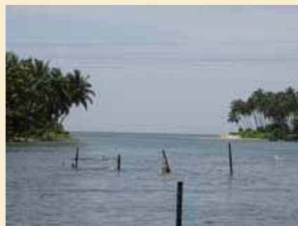
Palakkode Azhimugham (Estuary)