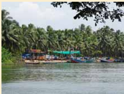
Fishermen and fishing boats