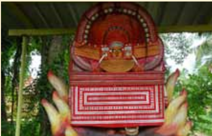
Theyyam Model of Muchilott Bhagavathy