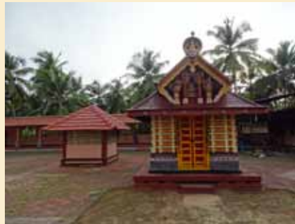
Kottappuram Sree Vaikunda Temple