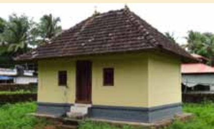
Sub-deity shrine, Sree Veerabhadra Temple