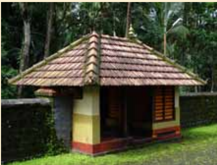
Mandapam in front of the temple