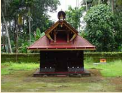
Sanctum Sanatorium, Sree Panayakkattu Bhagavathy Temple