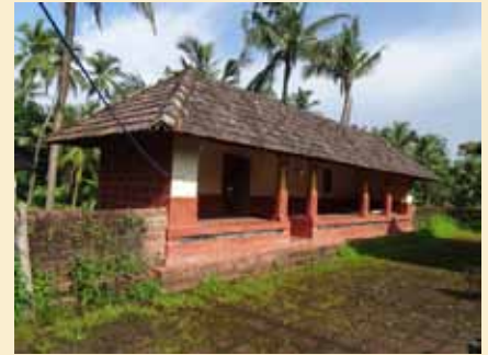
Mandapam in front of the temple