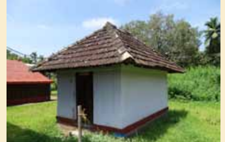
Sub-deity Temple of Payyanur Subrahmanya Temple