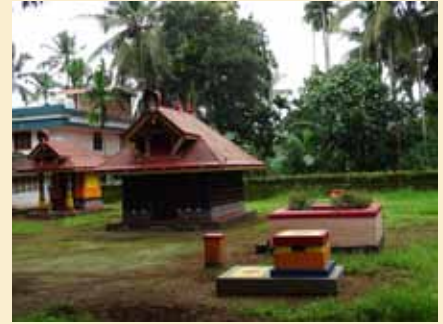
Sree Panayakkattu Bhagavathy Temple, Kodakkad