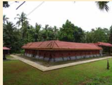
Lord Shiva Temple, Cheemeni