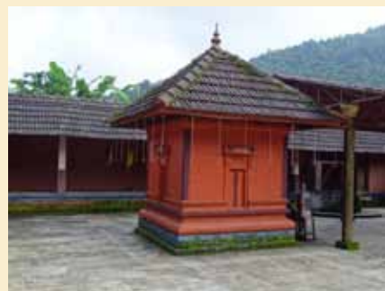
Kunnathurpadi Muthappan Devasthanam