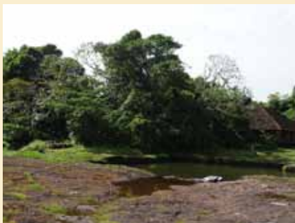
Serpent grove and pond, Kodoth