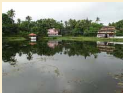
View of Thekke Kovilakam entrance and Pond