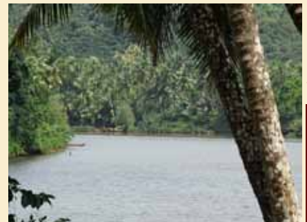
Beautiful Thejaswini River