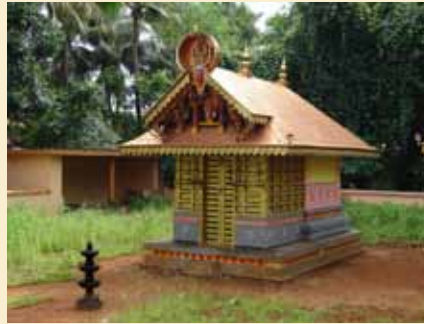
Shrine of Anjootambalam Veererkavu