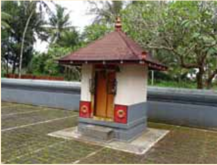
Sub-deity, Sree Kuruvappalli Ara