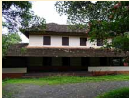
Kinavoor Kovilakam, Nileschwaram