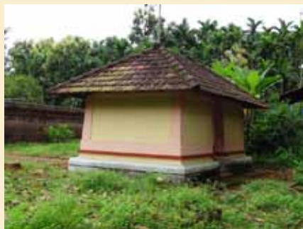
Sree Rayamangalam Bhagavathy Temple, Pilicode