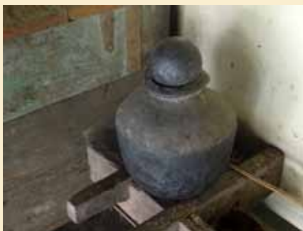
An old bronze pot