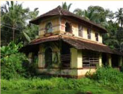
Cow Shed, Nileshwaram Palace