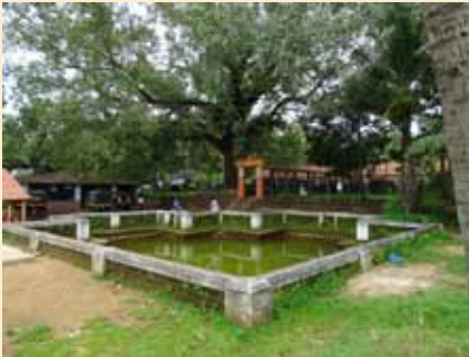
Temple pond, Sree Kuruvappalli Ara