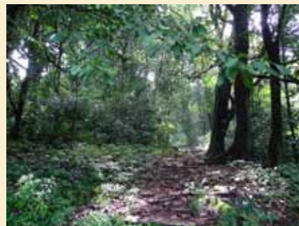
Forest trails to Kunnathurpadi Muthappan Devasthanam