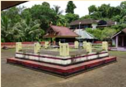
Another view of the temple