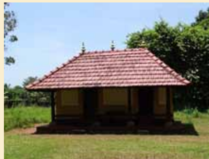
Shrine of Padinjattu Puthiya Bhagavathy