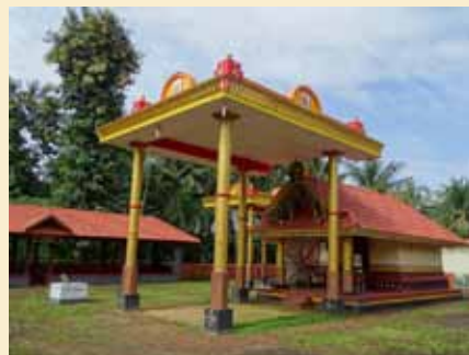
Kalarathri Bhagavathy Temple, Kolathur