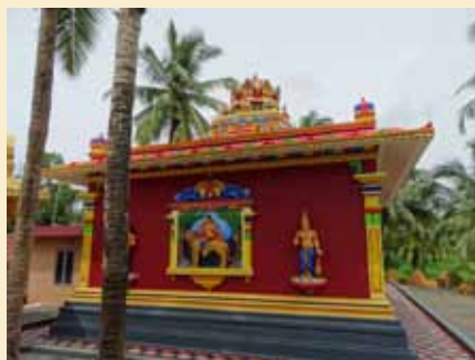
Ayyappa Bhajan Mandiram, Udma