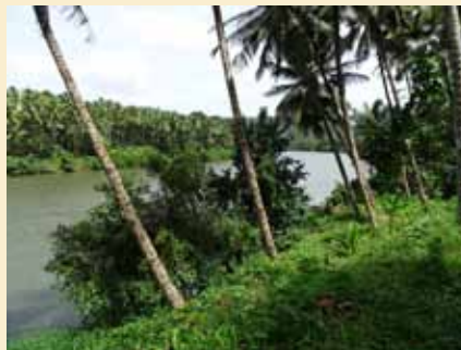
Thejaswini River view