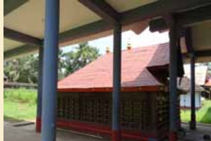
Sub-deity of Subrahmanya Swami Temple