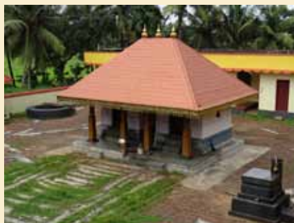
Sree Nagacherry Bhagavathy Temple