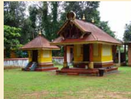
Sree Puliakkatt Vishnumoorthy Temple