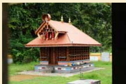
Another view of Manakkad Bhagavathy Temple