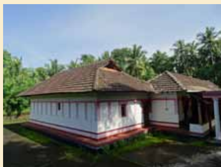
Kodoth Tharavaadu Temple