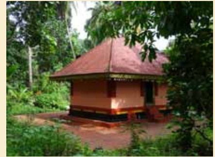
Another Sub-deity, Mannampurathu Kavu