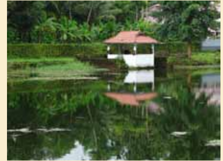
Pond near Thekke Kovilakam