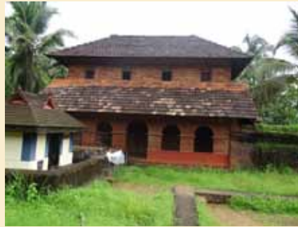
An old palace near the temple