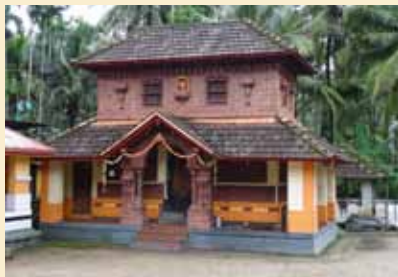
Angakalari Sree Vettaikorumakan Kottaram