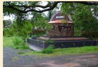
Kavilbhavan Yoga and Nature Cure Centre