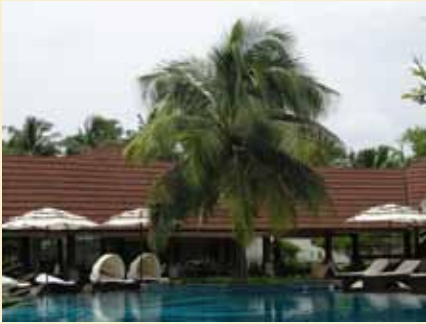
Cottages, The Lalit Resort, Bekal