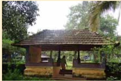
Another entrance of the temple