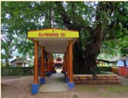
Entrance to the temple