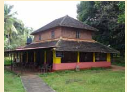
Vaniyillam Ancestral home