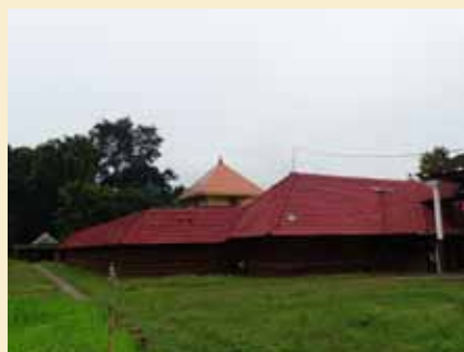
Sree Chakarapani Temple