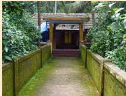
Sri Kaitheri Edam Bhagavathy Temple