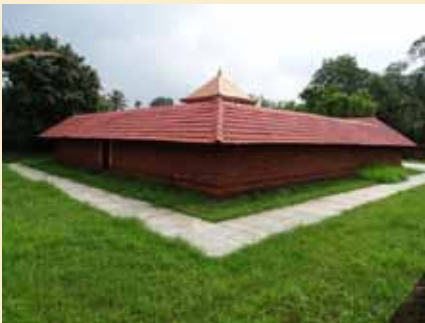
Vettaikkorumakan Temple, Kozhuval