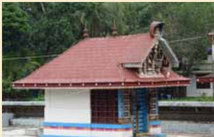
Sub-deity shrine, Lord Rama Temple