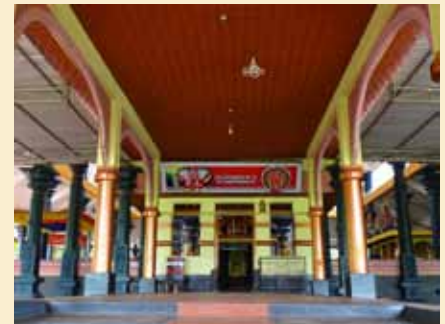
Front view of the temple