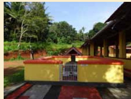
Shrine of Gulikan