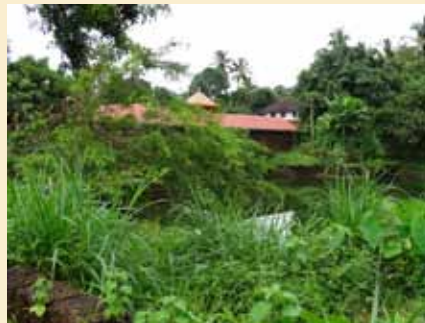
Temple Pond of Vettaikkorumakan Temple, Kozhuval