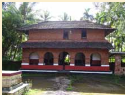
Kodoth Tharavaadu entrance