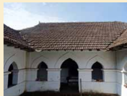
Kodoth Tharavaadu House