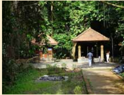
Sree Mookambika Temple & Sacred Grove at Paliyeri