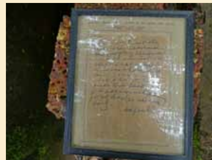
Gandhiji's message at Rajah's School, Nileshwaram