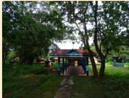
Vaniyillam Someswari Temple, Karivellur