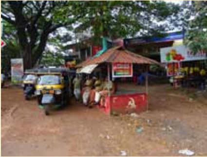
Auto Stand, Karivellur