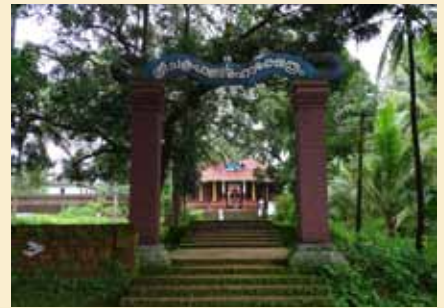
Entrance gateway of Sanctum Sanatorium