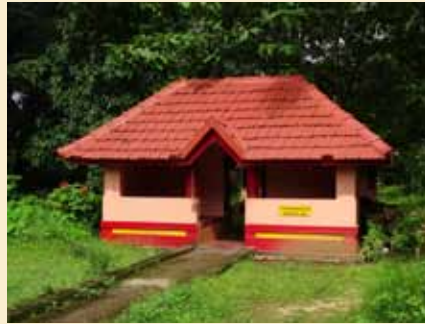
Sub-deity, Mannampurathu Kavu