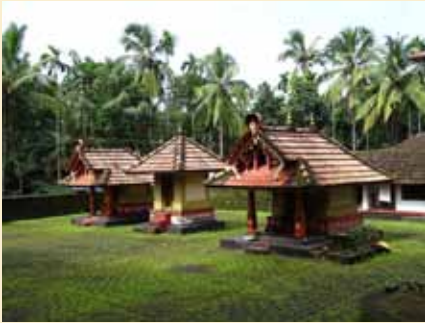
Pothavoor Sree Meledath Poomaala Bhagavathy Kavu Munda