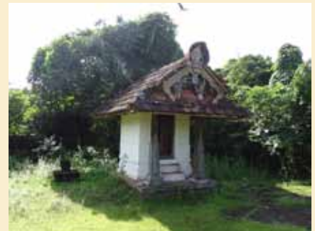
Serpent Shine, Kodoth