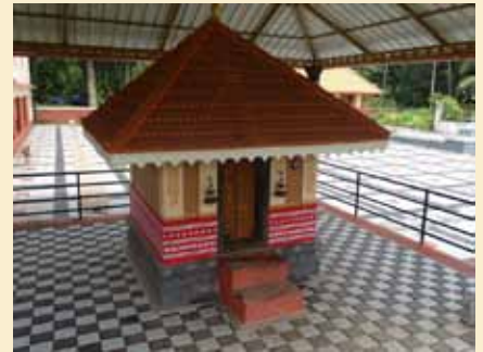
Thayathuveedu Tharavaadu Temple