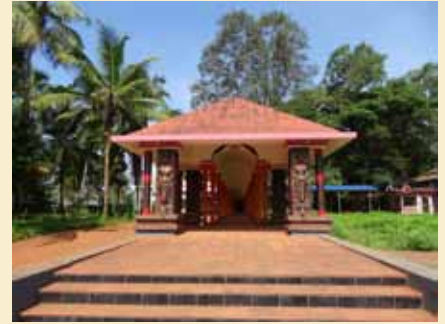
Sree Kottanachery Temple Corridor