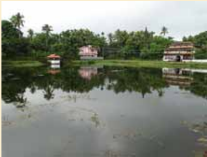
View of Thekke Kovilakam entrance and Pond