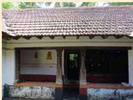
Family deity worship place of Kodoth Tharavaadu