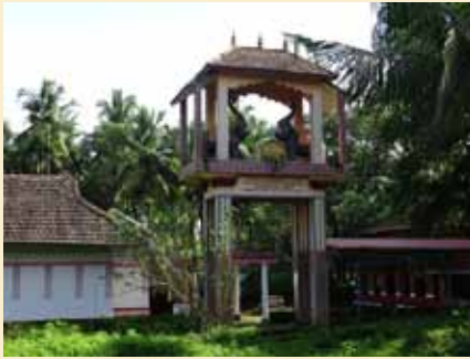
Kodoth Tharavaadu Meethmala House, Verikkulam