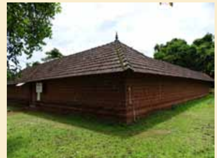
Ayyamkunnath Bhagavathy Temple, Kasaragod