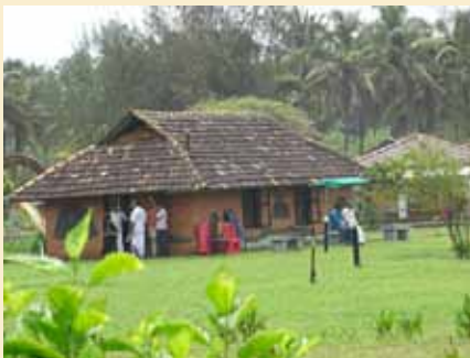
Bekal Fort Beach Park building