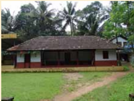
Koothumadam, Sri Kaitheri Edam Bhagavathy Temple