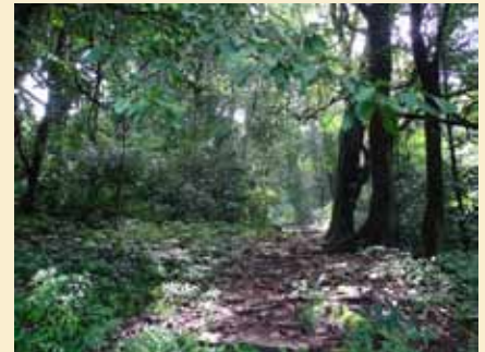
Forest trails to Kunnathurpadi Muthappan Devasthanam