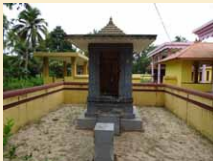
Nadakkavu Kovval Mundya Devasthanam