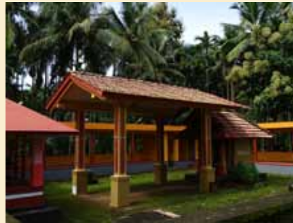
Sree Meledath Poomaala Bhagavathy Kavu