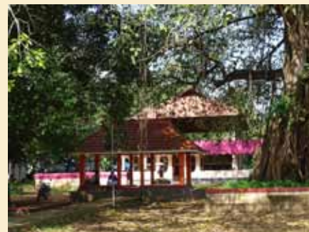
Vellur Sree Kudakkath Kottanachery Temple