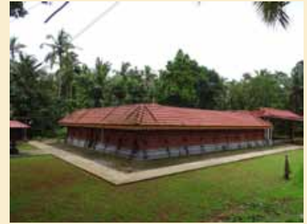
Lord Shiva Temple, Cheemeni