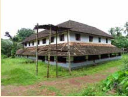
Kakkat Madathil Kovilakam