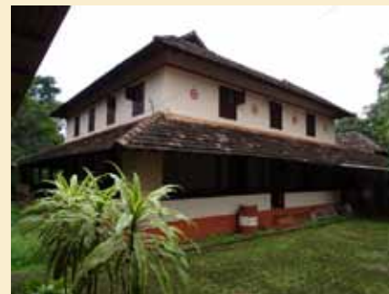
Inside view of Kinavoor Kovilakam