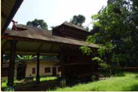
Sree Porkkali Kavay