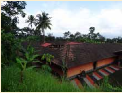
Panoramic view of Kunnathurpadi Muthappan Devasthanam