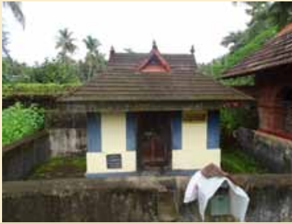
Shrine of Perattur Bhagavathy