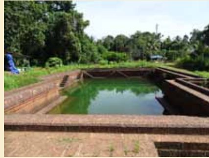
Temple pond of Sree Kottanachery Temple