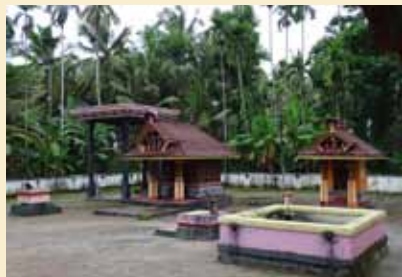
Angakalari Sree Vettaikorumakan Kottaram Padaarkulangara Bhagavathy Temple