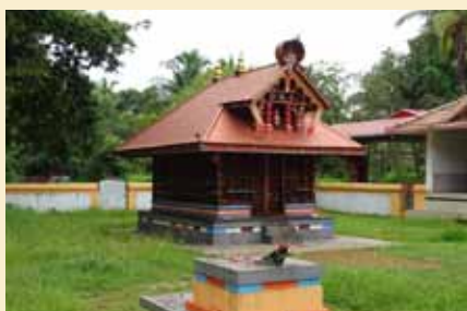
Manakkad Bhagavathy Temple