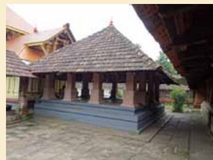
Namasakara Mandapam, Sree Chakarapani Temple