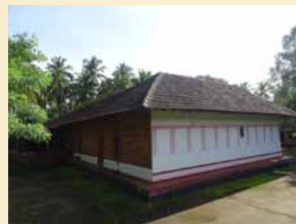
From back, Tharavaadu Temple of Kodoth