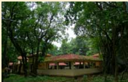
Outside view, Sree Olavara Mundyakavu Temple