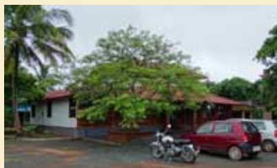
Kavilbhavan Yoga and Nature Cure Centre