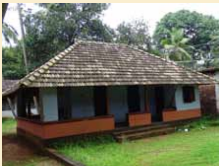
Priest home of Sree Puliakkatt Vishnumoorthy Temple