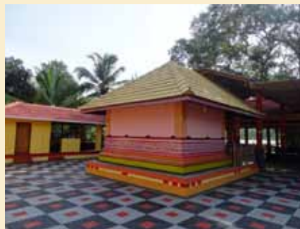
Sree Chooliyar Bhagavathy Temple, Kundamkuzhi Nagaram Verikkulam