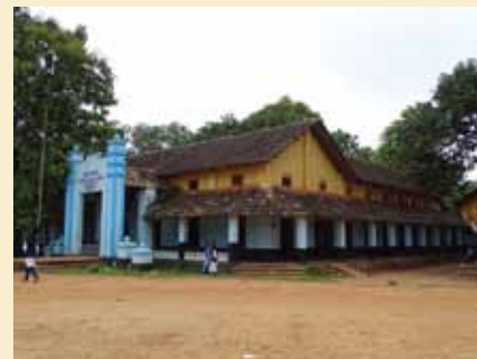
Rajah's Higher Secondary School, Nileshwaram