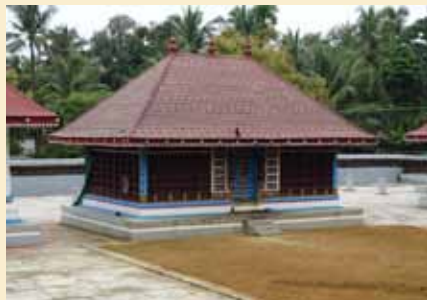
Lord Rama Temple, Thankayam