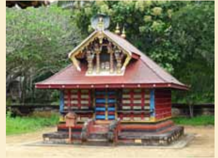
Chandra Muchilott Bhagavathy Temple