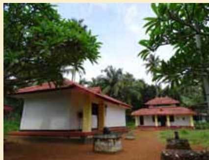
Padinjhattam Kozhuval Sree Puliakkat Yogi Madam