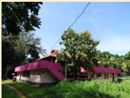
Outside view of the temple