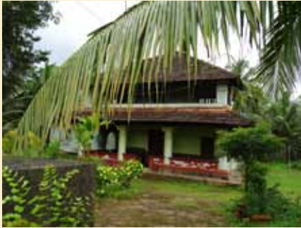
A heritage home, Nileschwaram