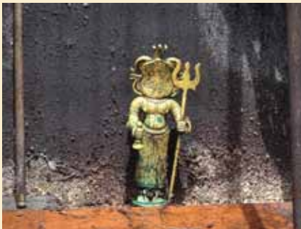
Vayanattu Kulavan Bronze Statue