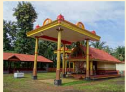
Kalarathri Bhagavathy Temple, Kolathur