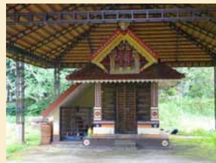
A temple in Thankayam