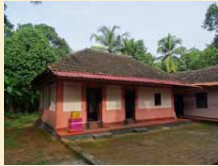
An ancestral home, Karivellur