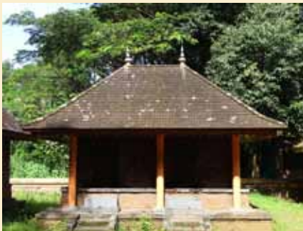
Sub deity shrine, Sree Porkkali Kavay