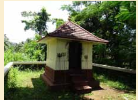
Shrine of Ettikulam Valiya Bhagavathy