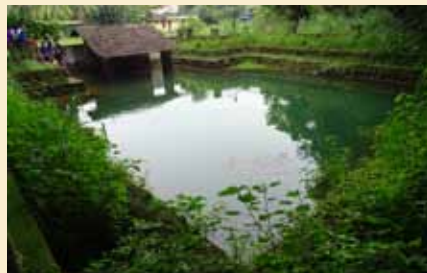
Temple pond, Sree Olavara Mundyakavu Temple