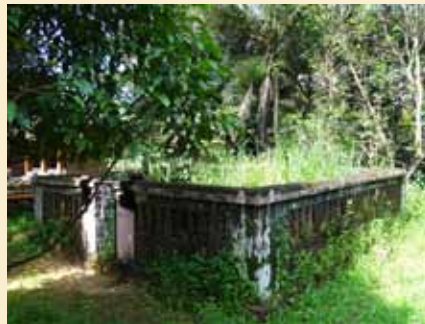
Serpent Grove, Sree Porkkali Kavay