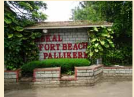
Entrance to Bekal Fort Beach, Pallikere