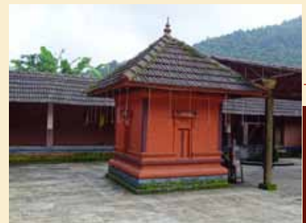
Kunnathurpadi Muthappan Devasthanam