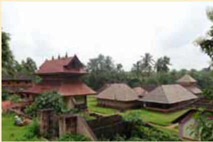
Sree Madiyan Koolam Temple, Kanhangad