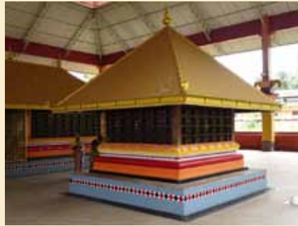
Sub-deity, Palakkunnu Bhagavathy Temple