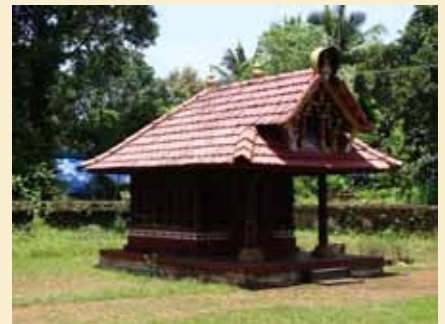
Padinjattu Puthiya Bhagavathy