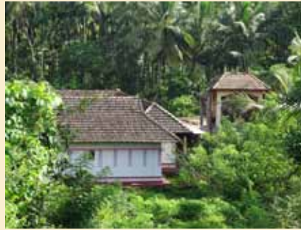
Top view of Kodoth Tharavaadu Meethmala House