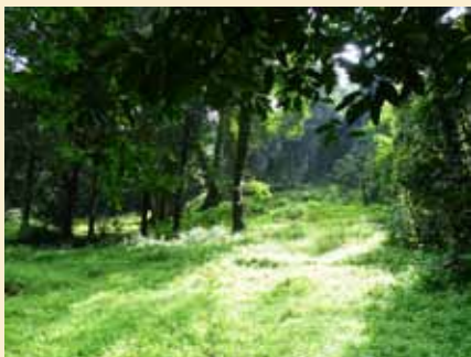
Green Haven of Muthappan at Kunnathurpadi