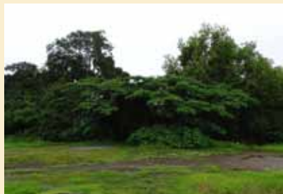
Serpent Grove, Padaarkulangara Bhagavathy Temple