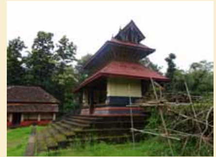
Madiyan Koolam Temple