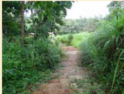
Way to Kunnathurpadi Muthappan Devasthanam