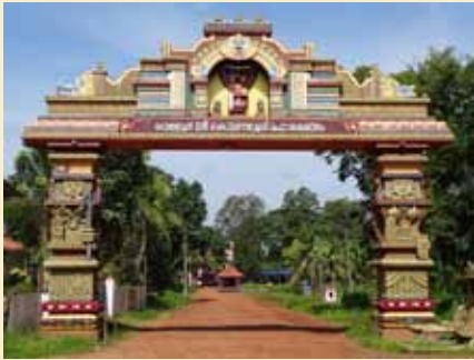
Entrance gateway of Sree Kottanachery Temple