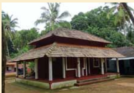
Olavara Vadakke Veedu Tharavaadu