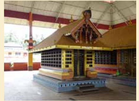
Shrine inside Palakkunnu Bhagavathy Temple