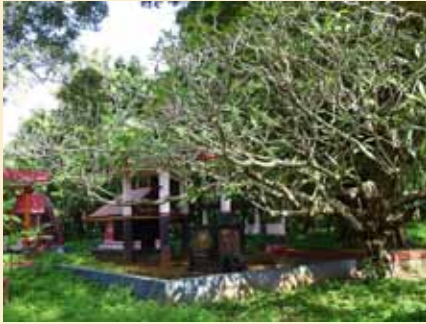
Kavu at Sree Kottanachery Temple