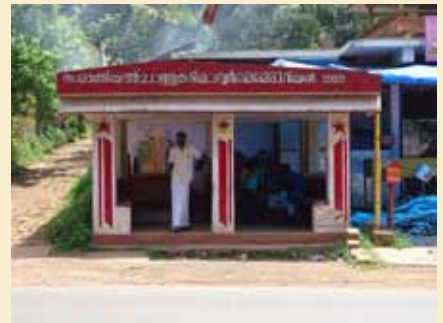
A memorial at Kuthuparamba