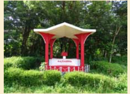
Kunjambu Memorial, Karivellur