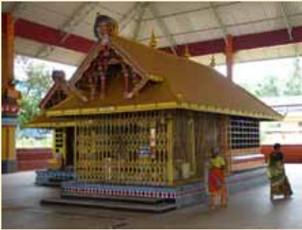
Palakkunnu Bhagavathy Temple