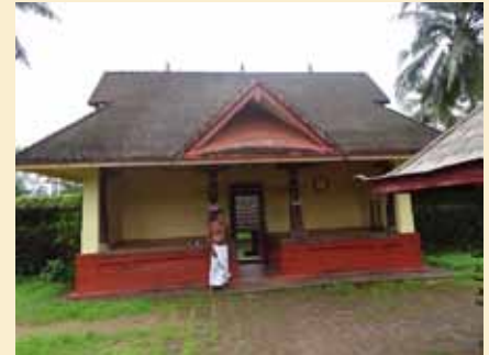
Entrance gateway of the temple