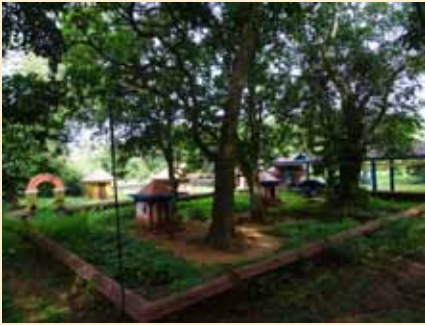
Karivellur Vaniyillam Someswari Temple