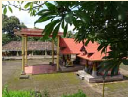
Top view of the temple