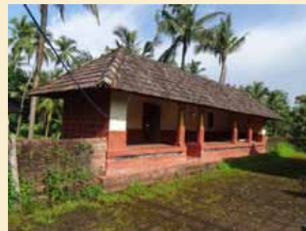
Mandapam in front of the temple