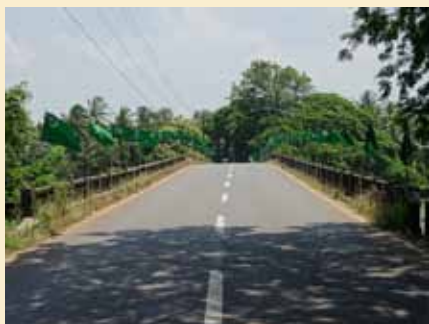
Punnakadavu Bridge, Payyanur