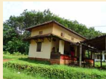
Andol Deshasevini Library