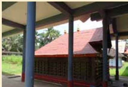
Sub-deity of Subrahmanya Swami Temple