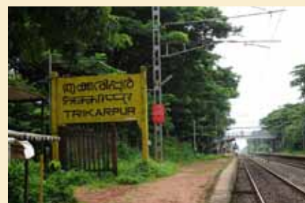
Trikkarippur Railway Station