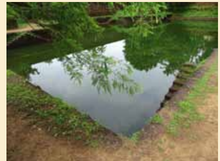
Temple Pond of Vettaikkorumakan Temple