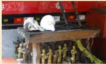
Conch Shell and Bronze Structure, Padaarkulangara Bhagavathy Temple