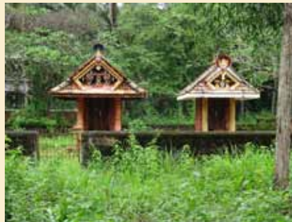
Sub-deity shrines, Chandra Muchilott Bhagavathy Temple