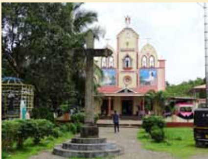
St. Alphonsa Church, Chayyoth