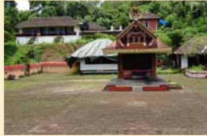
Bhagavathy Vettaikorumakan Temple, Chathamath