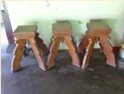
Theyyam performing stool