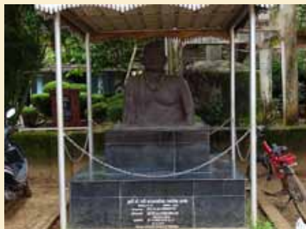
Sri. T.C. Ramavarma Valiya Raja Memorial