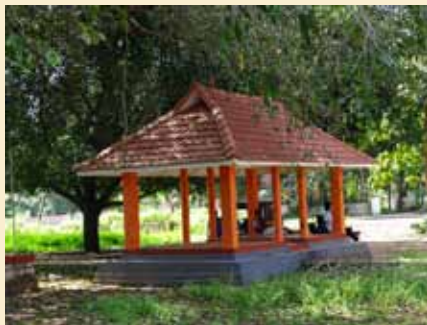
Entrance Mandapam of the temple