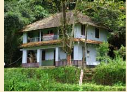
Parakkol. K Narayanan Memorial Library