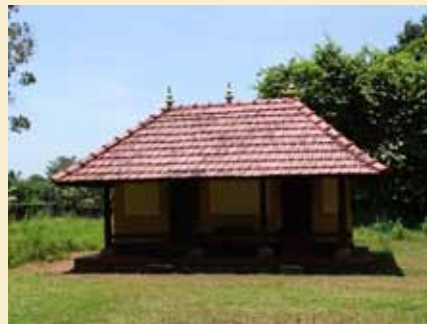
Shrine of Padinjattu Puthiya Bhagavathy