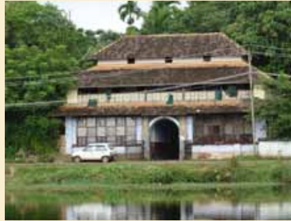
Entrance Structure of Thekke Kovilakam