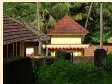
Kalingoth Kalari Tharavadu