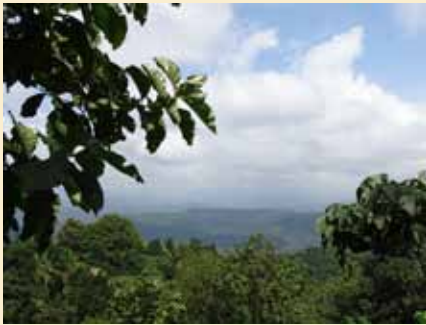
Hills of Payyavoor