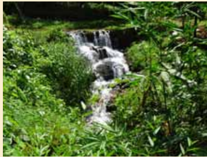
Waterfall near the temple