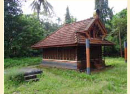
Madappally Someswari Temple