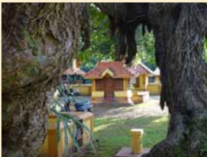
Kanhangad Theruvath Sree Arayil Bhagavathy Devalayam,