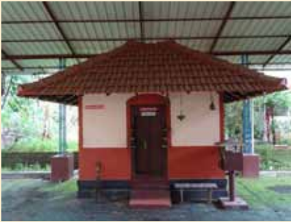
Kunjaar Kurathi Temple, Kottilaveedu Tharavaadu