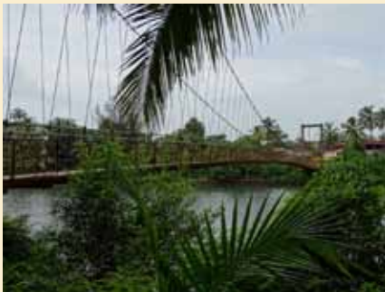
Padannakkad Hanging Bridge