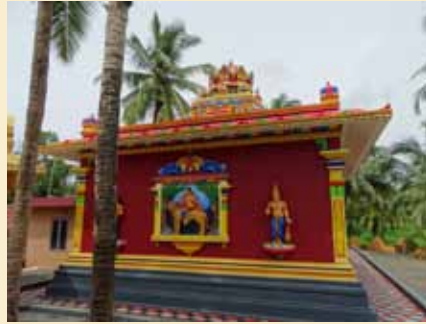
Ayyappa Bhajan Mandiram, Udma