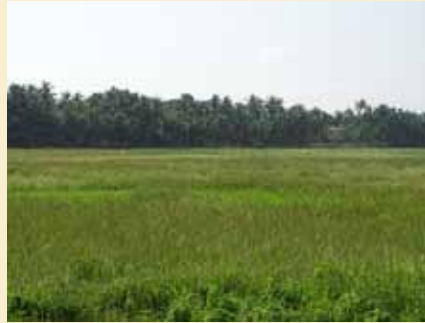
Paddy field, Karivellur