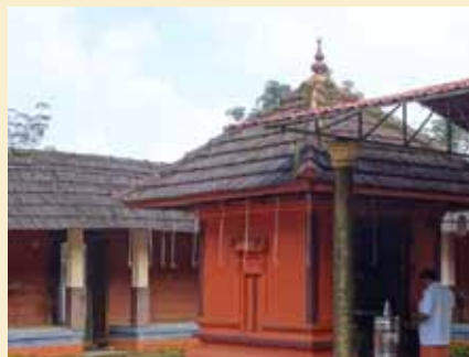
Shrine of Lord Muthappan at Kunnathurpadi