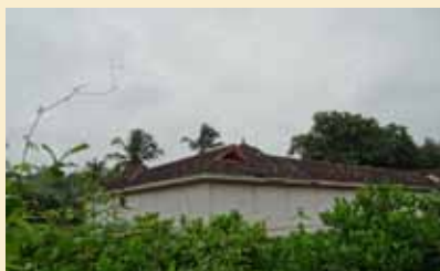
Sree Shasthamangalathappam Shiva Temple, Poovalamkai