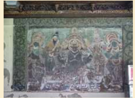
Mural Painting, Madiyan Koolam