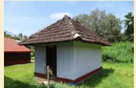
Sub-deity Temple of Payyanur Subrahmanya Temple