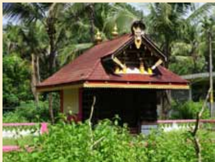
Sree Kudakkath Kottanachery Bhagavathy Temple