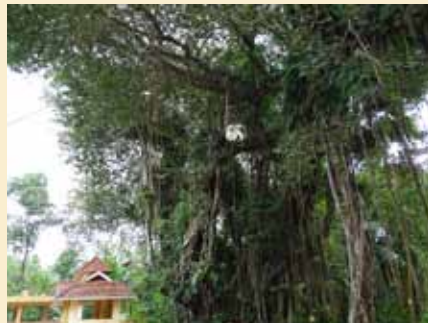
Huge Banyan Tree in front of the temple