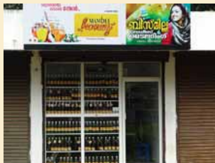
Honey Sales Outlet, Thankayam