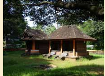
Sub deities, Sree Porkkali Kavay