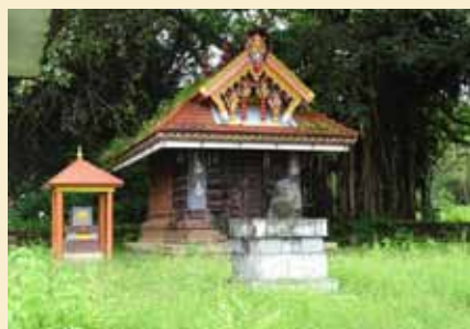
Kunjalinkeezhil Temple, Olavara