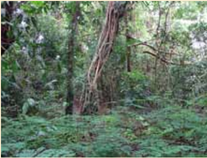
Sree Mannampurathu Kavu Bhagavathy Temple