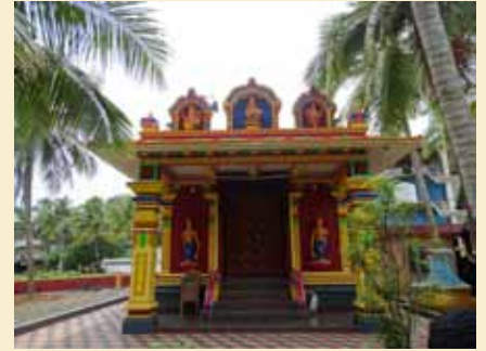
Ayyappa Temple, Udma