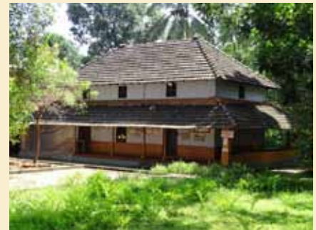
Priest home of Kandoth Sree Kurumba Bhagavathy