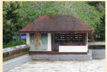
Model of Veerabhadran Theyyam