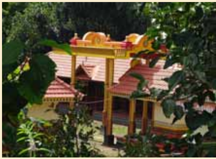
From top, Kalarathri Bhagavathy Temple, Kolathur