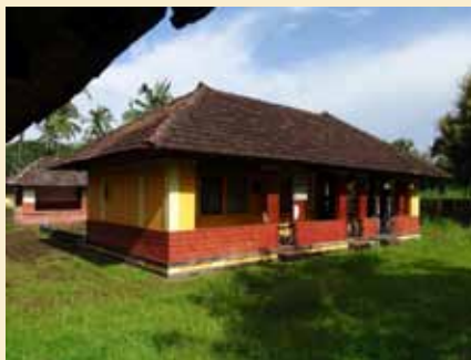
Panayal Perunthatta Chamundeshwari Devasthanam