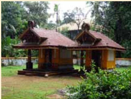
Kootathilara Sree Vishnumoorthy Temple