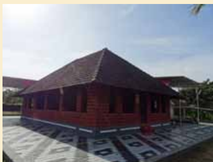
Mandapam inside the temple