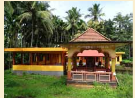
Sree Meledath Poomaala Bhagavathy Kavu