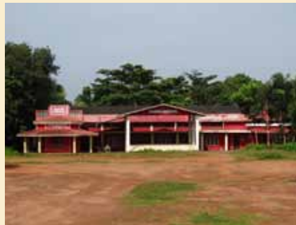
Martyr's Memorial, Karivellur