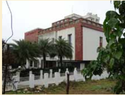
J K Residency - business hotel