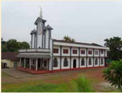
St. Antony's Church, Cheemeni