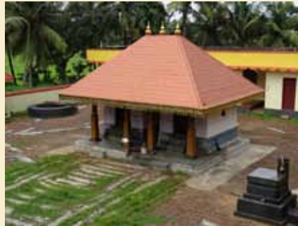
Sree Nagacherry Bhagavathy Temple