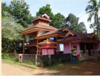
Chamundeswari Devasthanam, Puthiyatheru