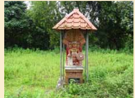
Vairajathan Theyyam Model