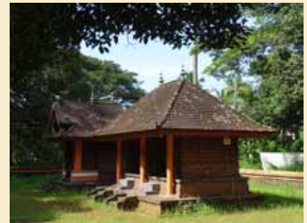
Sree Porkkali Kavay Temples