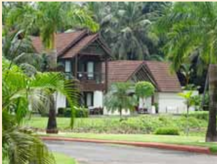
The Lalit Resort, Bekal