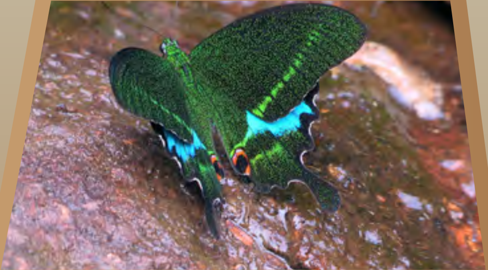
Paris Peacock Butterfly