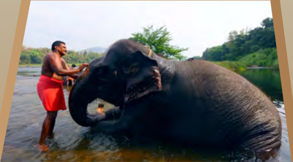
Elephants at Kodanad