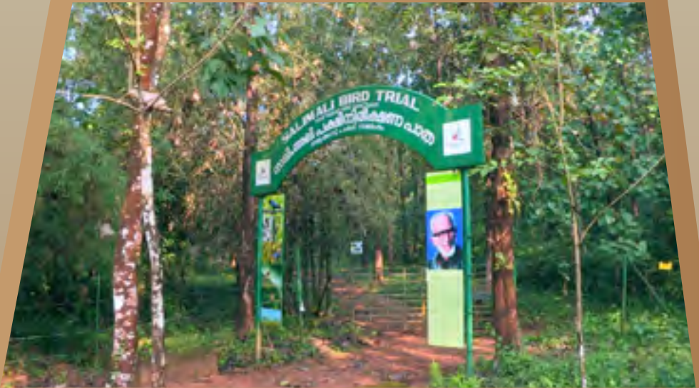
Thattekkad Bird Sanctuary