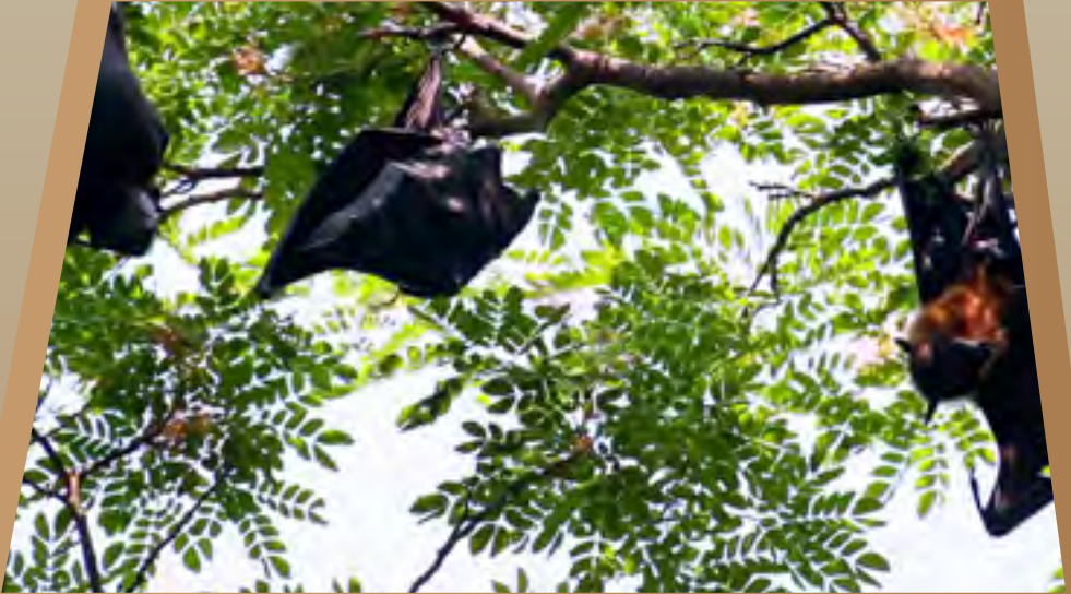
Mangalavanam Bird Sanctuary