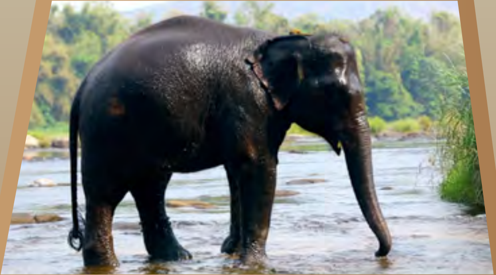
Baby Elephant at Kodanad