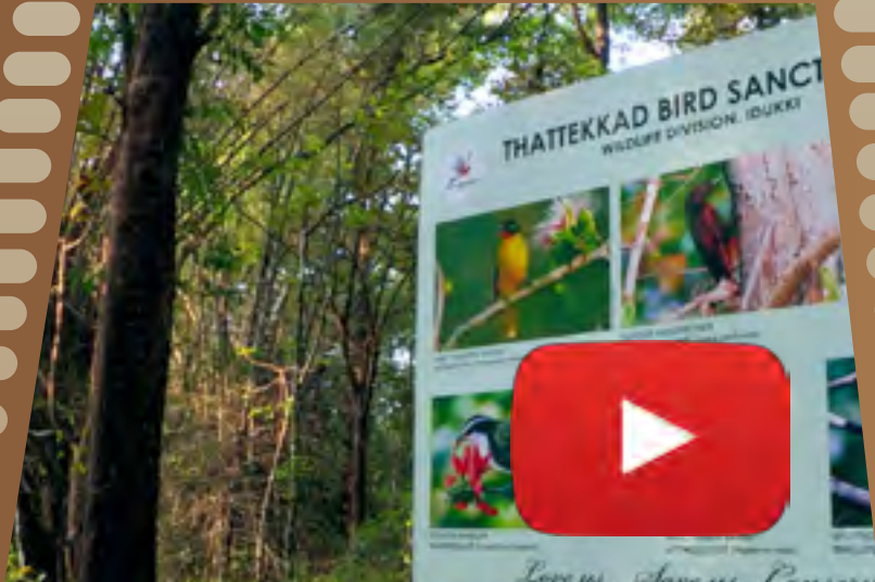
Thattekkad Bird Sanctuary