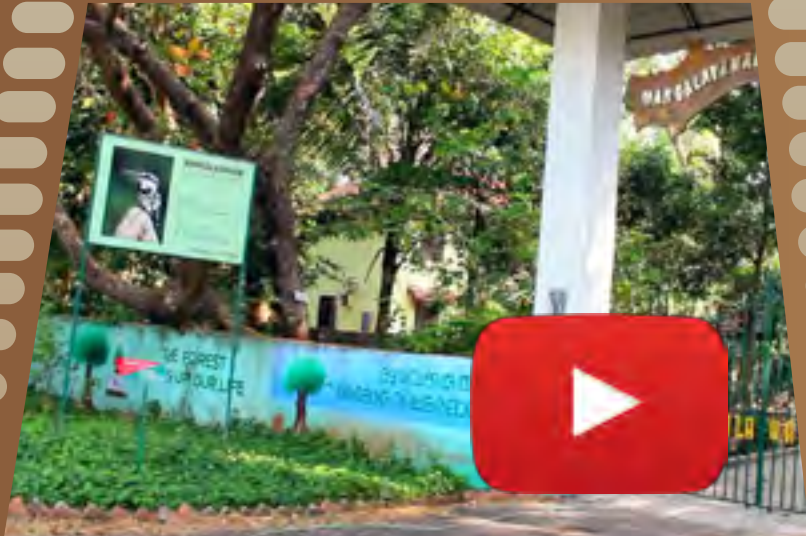
Mangalavanam Bird Sanctuary