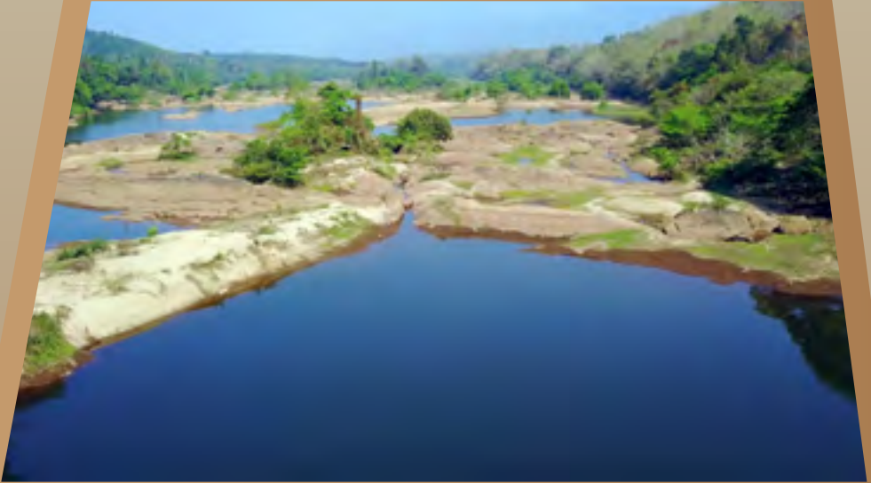
River Periyar in Bhoothathankettu