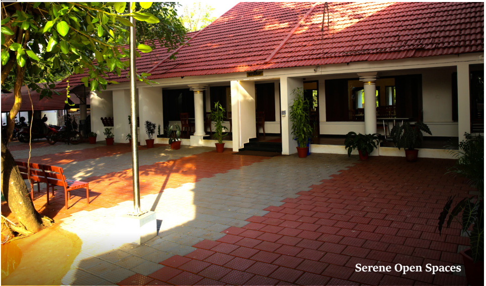
Serene Open Spaces