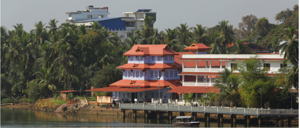
Parassinikadavu Temple, about 4 km