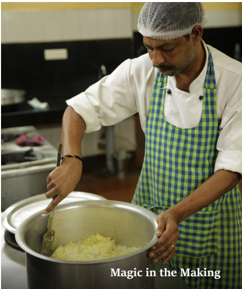
Magic in the Making