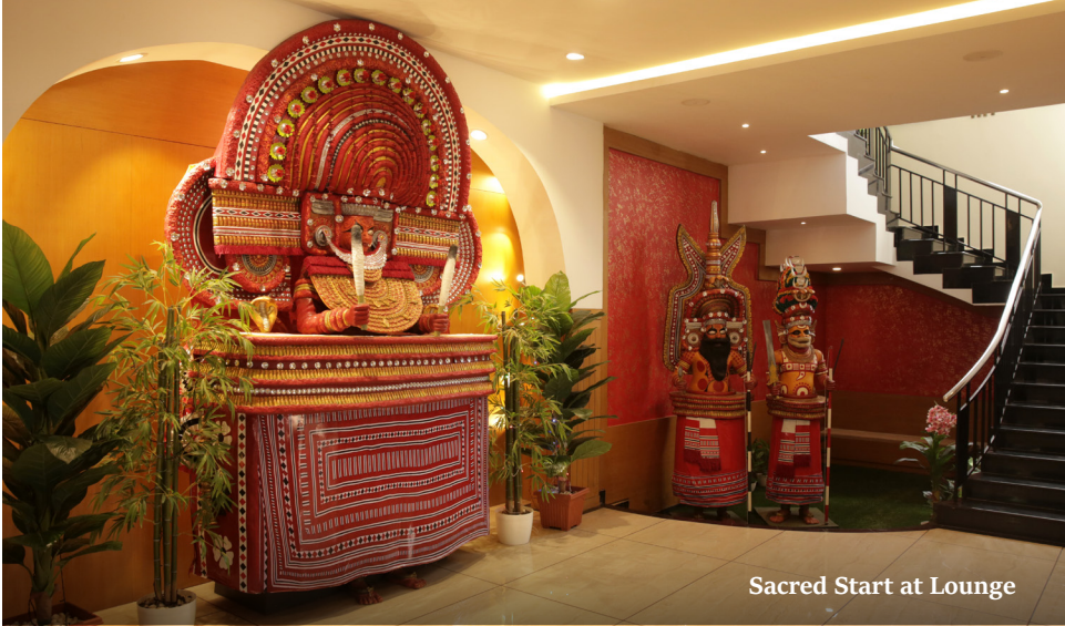
Sacred Start at Lounge