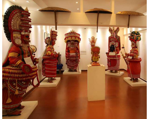
Chirakkal Folklore Museum about 8 Km