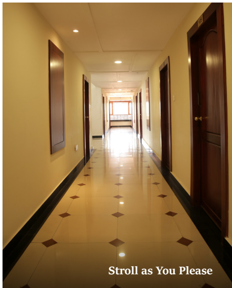
Stroll as You Please