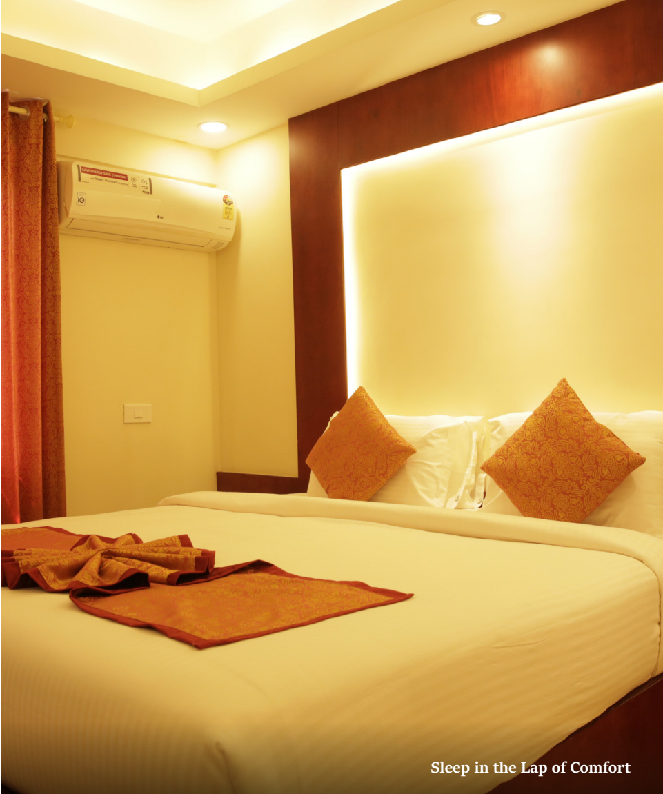
Sleep in the Lap of Comfort