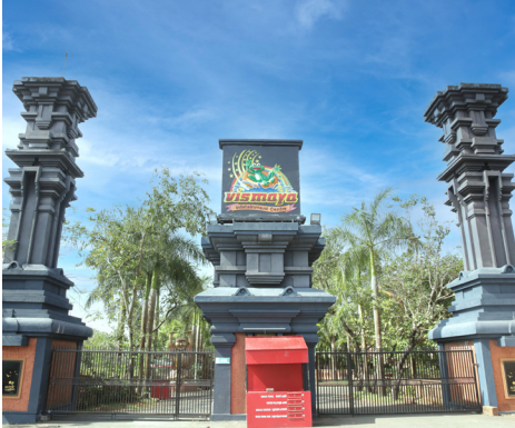
Vismaya Amusement Park, about 3 Km