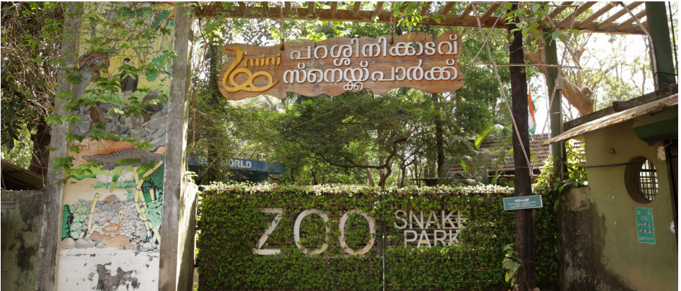
Parassinikadavu Snake Park, about 1 Km