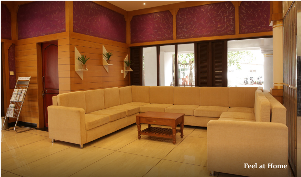
Feel at Home