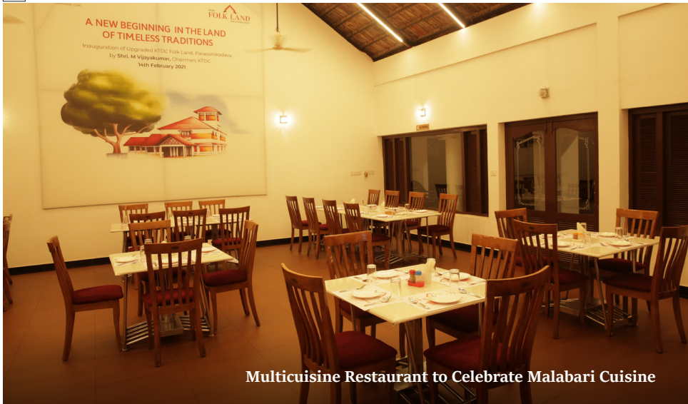
Multicuisine Restaurant to Celebrate Malabari Cuisine