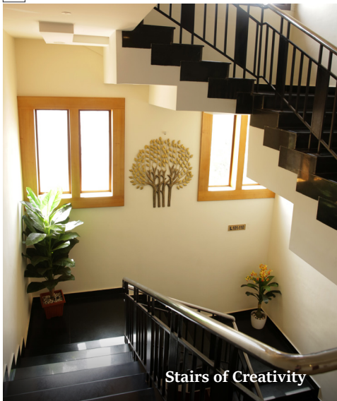
Stairs of Creativity