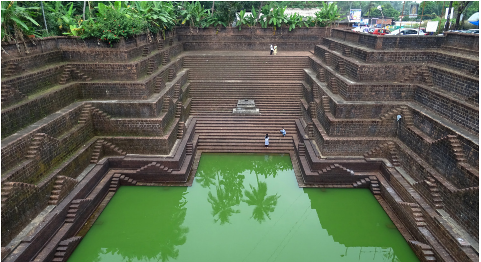
Rajarajeswara Temple, Thaliparambu, about 5 Km