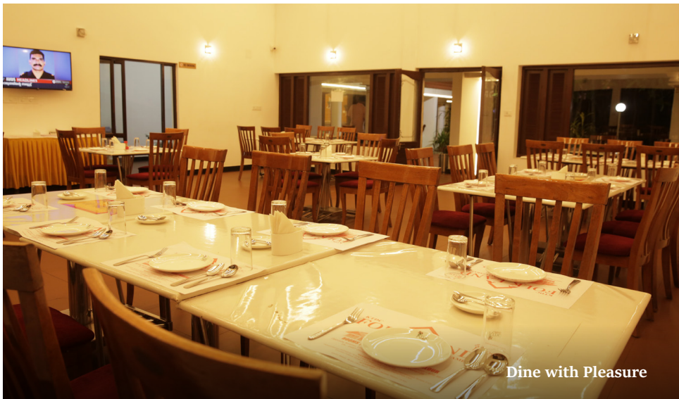
Dine with Pleasure