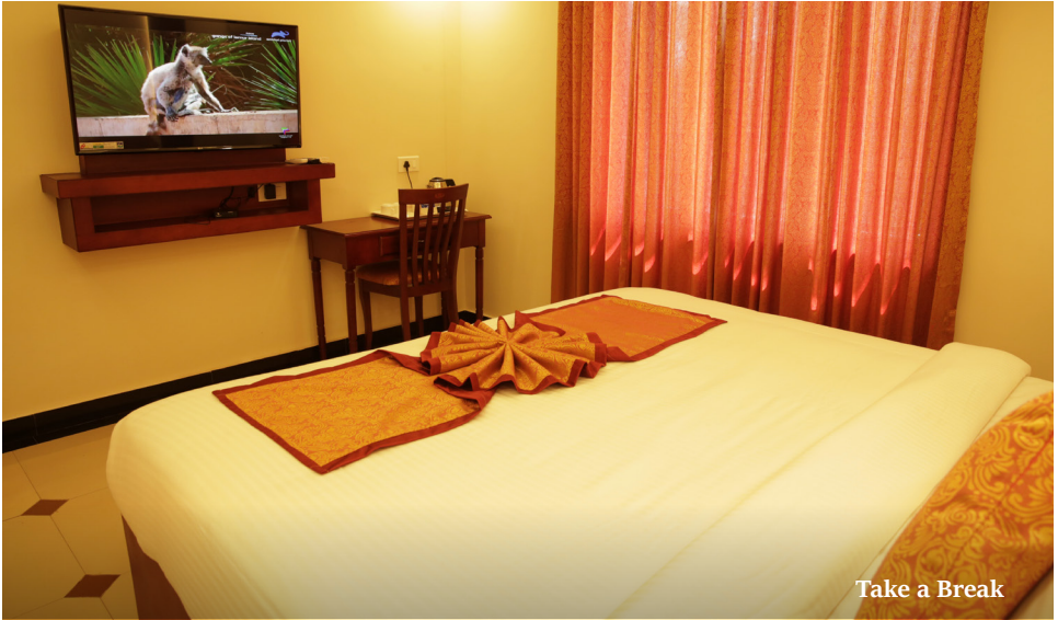
Take a Break