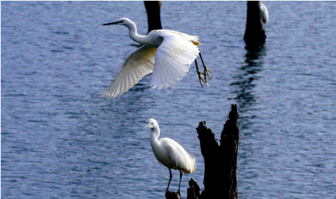
Little Egret ( Egretta Garzetta )