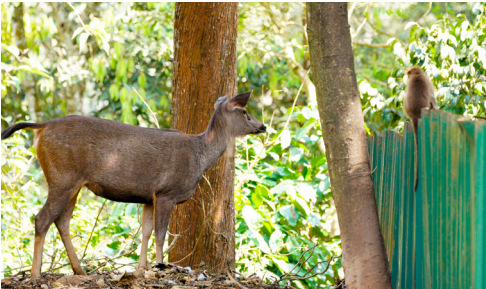
Sambhar Deer ( Rusa Unicolor )