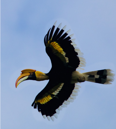
Great Indian Hornbill ( Buceros Bicornis )