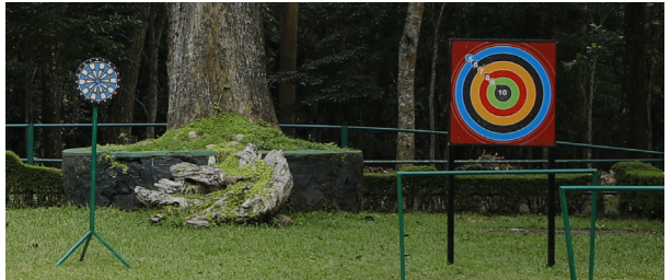
Children's park, basketball court, archery centre & lookout towers will engage visitors