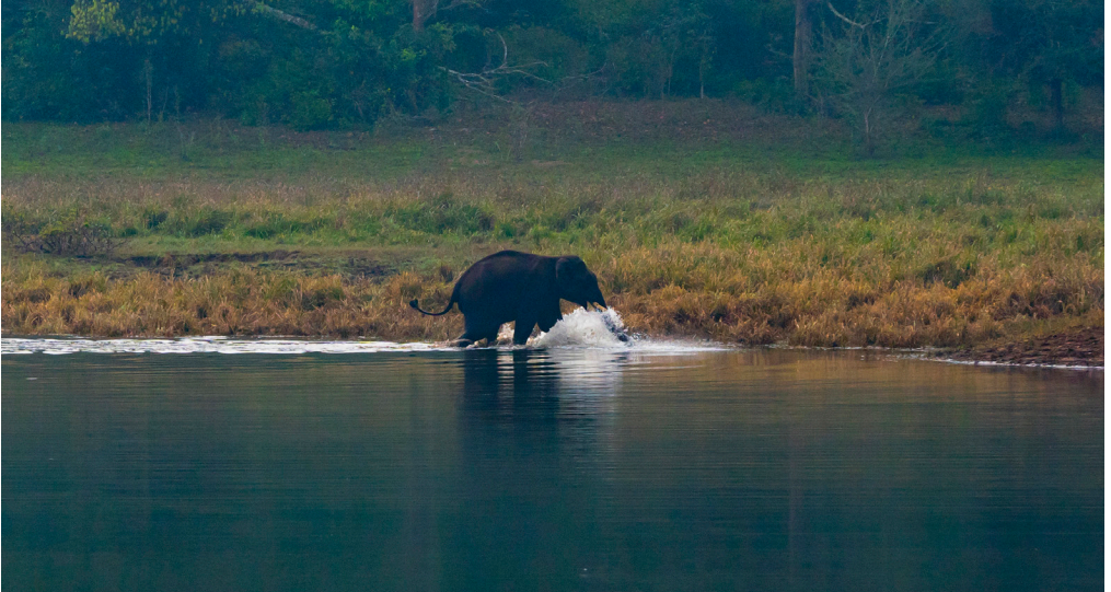
Elephant ( Elephantidae )