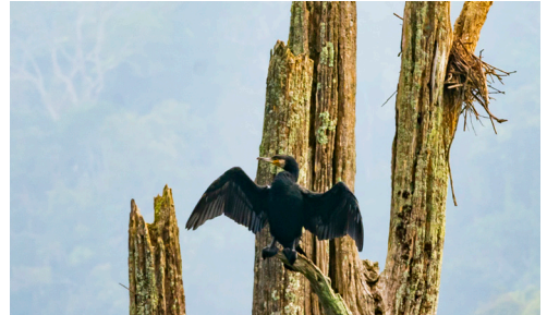
Little Cormorant ( Microcarbo Niger )