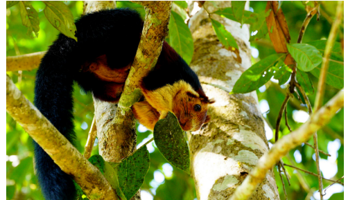
Malabar Giant Squirrel ( Ratufa Indica )