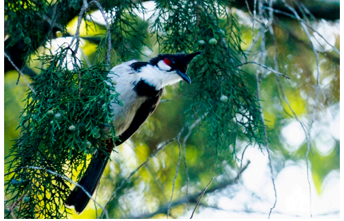
Red-whiskered Bulbul ( Pycnonotus Jocosus )