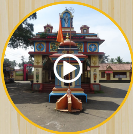
Sree Vallabha Temple